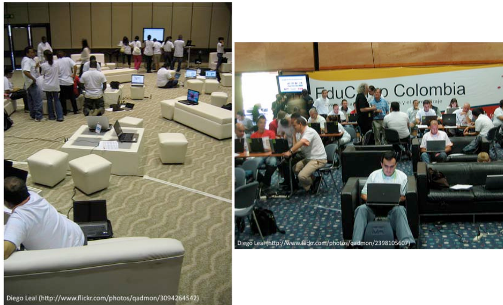
Figure 3. Examples of furniture and space.

The workshop included activities that created new opportunities for interaction among participants. An equally important aspect was the space in which these activities were carried out: an unstructured, disorganized space that, along with the furniture used, conveyed a clear and positive message about the nature of the activity developed throughout the day (see Figure 3). This aspect was the first un-structuring element, because the attendees came to a workshop on technology and discovered an informal and flexible environment, which was integral to the activities taking place. It is worth noting that the level of un-structure of the space depends largely on local conditions. (For a more detailed discussion on this topic, see Leal, 2010.)