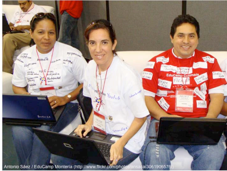
Figure 2. Participants with tags on their clothing.