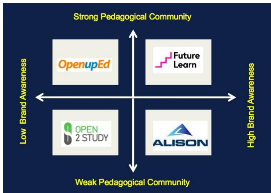
Figure 3: Example decision plot

In a similar vein, we have generated valuable dialogue and matured our thinking by plotting different MOOC options on a chart in order to highlight key differences where the x and y axis represent specific variables. For example, Figure 3 depicts the differences we perceive between four different MOOC options according to brand awareness ( x ) and strength of pedagogical community ( y ). The figure below shows FutureLearn in the most desirable top right quadrant with both high brand awareness and a strong pedagogical community supporting future development. Of course, this assessment reflects a European bias as FutureLearn has yet to establish a major foothold in North America. In the case of Open2Study, the bottom left quadrant reflects the fact that this MOOC is very much an Australasian initiative but the position could change in the future. Importantly, the relative position of the MOOC platforms changes depending on the variables, especially if you select the cost of the option compared to brand awareness or the ability to make local customisations compared to the strength of the pedagogical community.