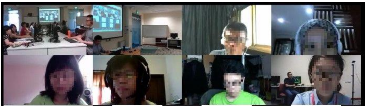
Figure 4. An illustration of the BSLE.

Implementation. Eight online students attended this session online. The instructor and most online students joined the video conferencing room before the lesson started. The instructor further reminded the online students to mute their mics. The student who complained about the sound problem attended this session from home again. He was happy with the improved quality of sound. Figure 4 shows what the BSLE looked like in this session.