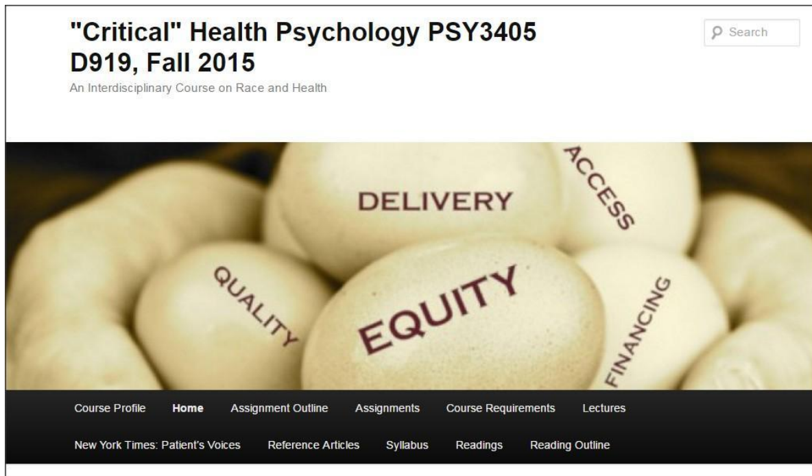
Figure 1. Detail of the Health Psychology landing page.

and assessment activities on a digital platform. Since the course site includes all required assignments and readings, the syllabus, due dates, etc., it is distinct from a traditional textbook because everything is in one online location - effectively a full course “hub” housed on a WordPress powered site on the City Tech OpenLab.