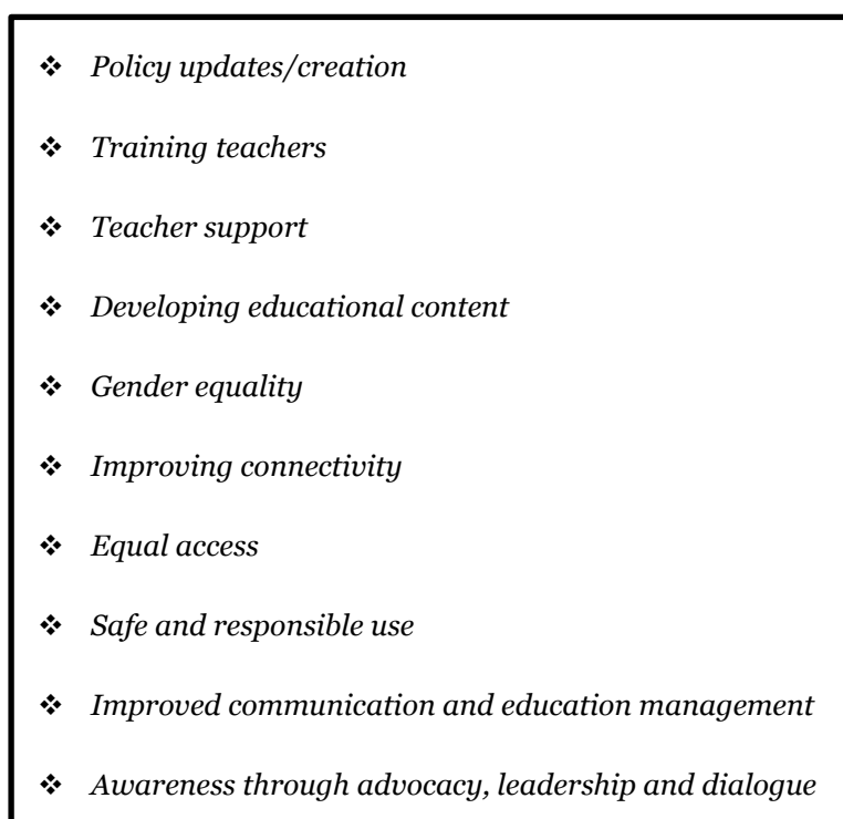
Figure 1. The 10 themes identified from UNESCO's guidelines, based on the six phases of thematic analysis identified by Braun and Clarke (2006).

Based on the six phases of thematic analysis identified by Braun and Clarke (2006), 10 themes have been identified from UNESCO's guidelines (see Figure 1).