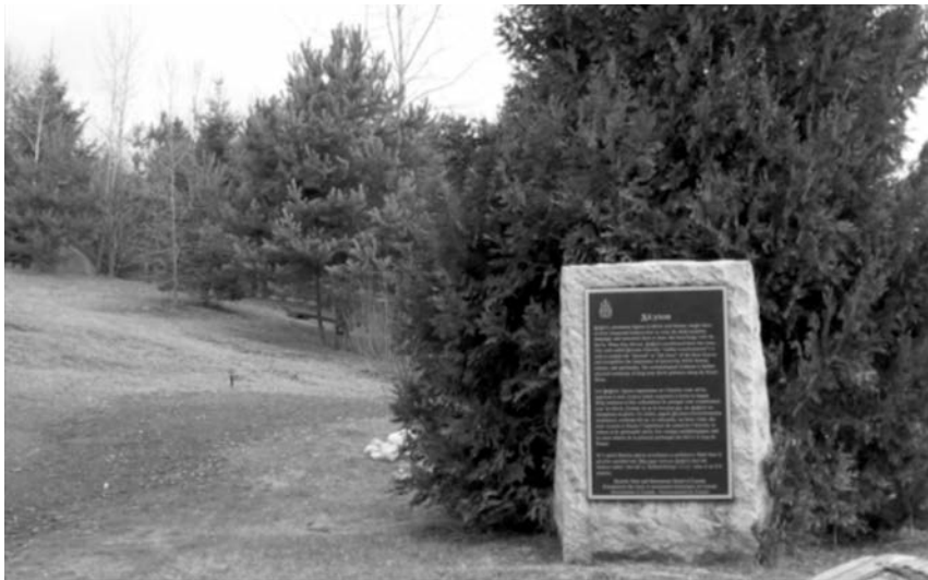
Figure 2. Parks Canada plaque at Xá:ytem. The sxwóxwiyám is presented first in English, then French, and lastly in Halq'eméylem.