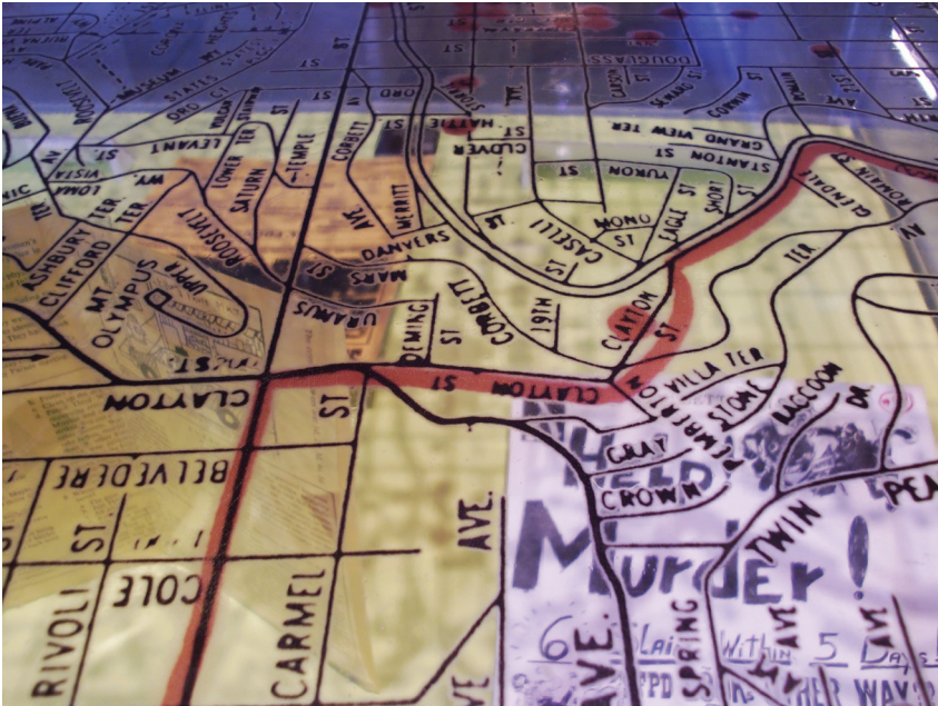
Figure 2: Aspects of the “Bearing the Scars” case at the GLBT History Museum, 2014

tourists, queer people, non-queer people, and school groups. 52 For the most part, the people who get the opportunity to make contact with these captivating objects are not those who would usually visit community archives. Unlike visitors' experiences in many modern museums, the way "Our Vast Queer Past" staged these archival objects was also reminiscent of the experience of archival encounters.