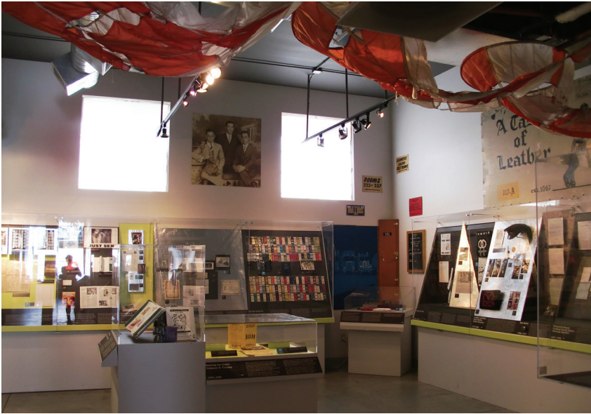
Figure 1: “Our Vast Queer Past” exhibit at the GLBT History Museum, 2014

pieces of clothing, sex toys, towels, or tarot cards. The objects housed in “grandma’s attic,” however, did not make their debut in the museum but were imbued with both the emotional character and the organization of their previous home in the GLBTHS Archives. After all, one of the primary goals of the museum was to showcase the varied items that resided in the archives, which are often only visited by researchers. Romesburg explains that “the museum was to showcase the archives’ depth and breadth, attract new collections, engage the public with the importance of queer history and powerful exhibitions linking past and present.” 47 In this way, the museum intended both to present the archival materials to the public as an education tool and to directly encourage monetary and archival donations that would benefit the archives.