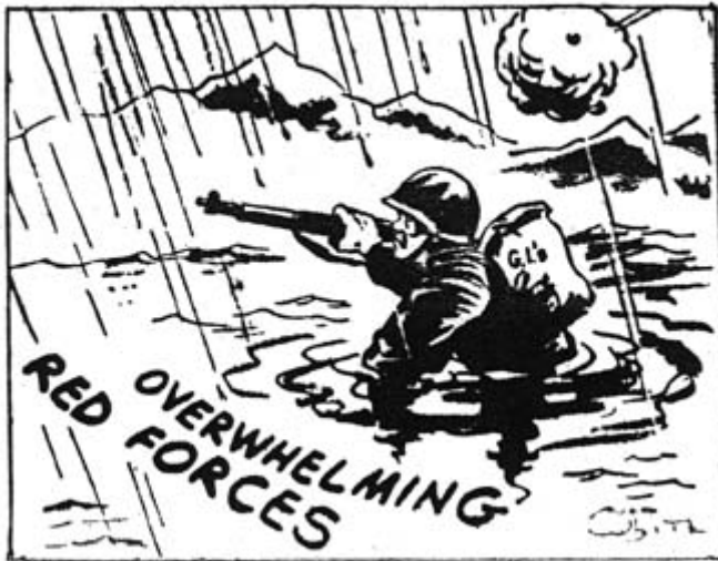
Figure 5 Situation Fluid Ned R. White, The Akron Beacon Journal

The themes of editorial art included domestic concerns within two weeks of the war's outbreak. Adjacent to a story titled "War Strains Expose Economy's 'Soft Spots,' The Pressing Problem is How to Avoid Inflation Without Harsh Controls" that reflected a fear of returning economic woes, was the "Breathing Down His Neck" image of Figure 6. 20 This shows the problems government leaders faced in trying to reduce taxes with the expenses of a new overseas war looming in the background, as well as the public's anxiety over the war's possible effects on them as citizens.