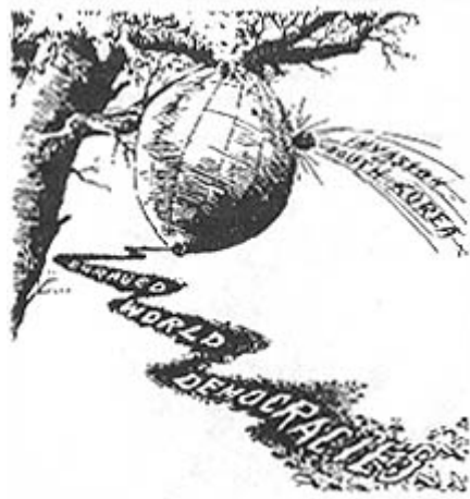
Figure 3 Starting something?

But allied efforts were not always smooth. As the war stalemated after a year, some of the UN partners chafed at various aspects of American command and feared they would be pulled into a larger US-Soviet war that might expand into their European backyard. One image from late June 1951 depicted Uncle Sam and Mao facing each other across a poker table, using soldier figures as chips. Behind Mao stood Stalin, but behind a worried-looking Sam were a dozen world leaders labeled "United Nations." The caption, "Kibitzer's Delight," clarified one of the main problems the US faced, that of leading a group with some common, but other divergent goals. 11