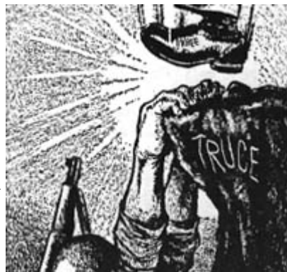
Figure 9 Resistance on the Last Ridge Don Hesse, St. Louis Globe-Democrat

By mid-1953, when peace talks were finally coming to fruition, South Korean President Syngman Rhee was often depicted as the major obstacle to achieving results. He adamantly was opposed to accepting any plan that did not reunify Korea and actually worked to undo the armistice on the eve of final agreements. 31 In Figure 9, "Resistance on the Last Ridge," Rhee's interference was characterized as significant enough to destroy the entire truce. 32