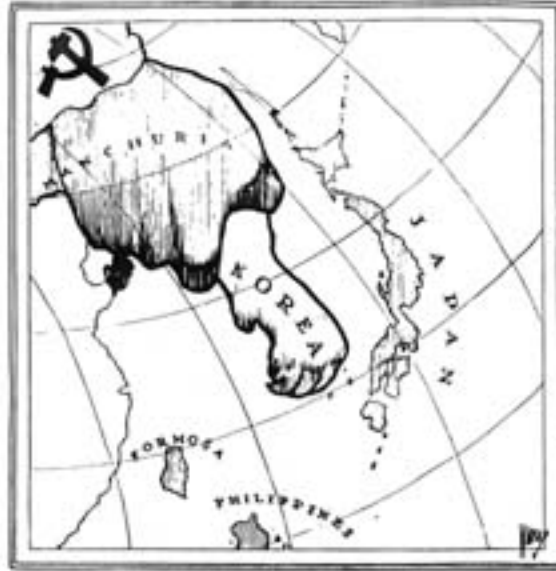
Figure 1 The Cat's Paw and the "Chestnuts" Edwin Marcus, New York Times

The notion that international Communist leaders were not behind the invasion of South Korea was lampooned in a cartoon from the London Daily Herald also reproduced on 2 July 1950. Tanks crashing through a barbed wire fence and headed toward a village formed the backdrop for a group of back-slapping uniformed men. Chinese leader Mao Zedong held a paper behind his back that said "Next step to shove America out of Pacific." The group stared out at the viewer, and Stalin gestured with open arms over the caption "Honest Mister, there's nobody here but us Koreans." 5 Clearly, cartoonist David Low did not believe any Communist claims of non-involvement in the actions of the North Koreans.