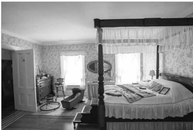
FIG. 8. DOROTHY WYATT'S BEDROOM FEATURING WALK-IN CLOSET, FOUR-POSTER BED, AND NURSERY FURNITURE. | ADAM KIRKEY, 2014.