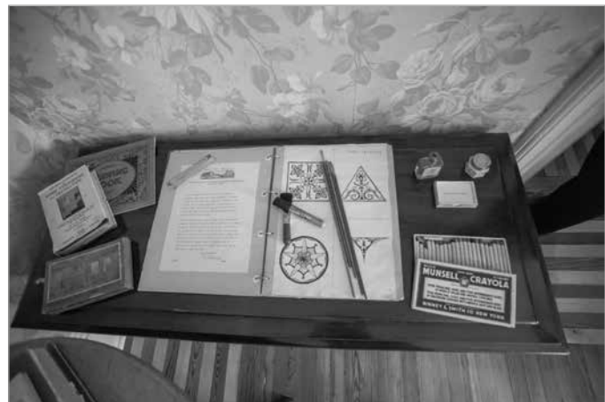
FIG. 9. A SELECTION OF DOROTHY WYATT'S ART SUPPLIES ON DISPLAY IN HER BEDROOM. | ADAM KIRKEY, 2014.

used to contest previously held assumptions about separate sphere ideologies.