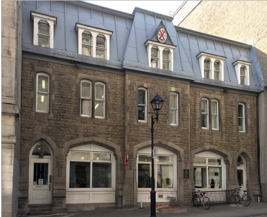
FIG. 5. LOWER SECTION OF STATION NO. 2, 444-448 RUE SAINT-GABRIEL, MONTRÉAL. | J.T. STUBBS, 2020.

same architectural "style": one with a single tower (used for stations 2 and 3), and one with a double tower, used when the fire station was combined with an adjacent police station (stations 6 and 8). All four structures were demolished at a later date, with the sole exception of the lower section of Station no. 2, which today survives in part, although without its tower, now at 444-448 Rue Saint-Gabriel (fig. 5).