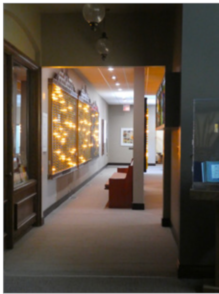
FIG. 3. ENTRANCE TO THE MEMORIAL LOUNGES FROM THE SOUTHWEST.