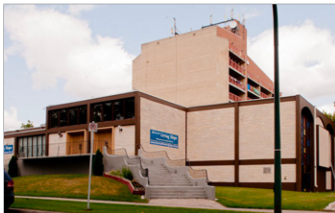
FIG. 10. EXTERIOR OF B'NAY ABRAHAM SYNAGOGUE.

revenue as well as creating a comfortable space for more extensive and expensive Jewish celebrations. The higher incomes of the second and third generations of Winnipeg Jewry, and their disinterest in daily religious practice, were reflected in this attractive edifice.