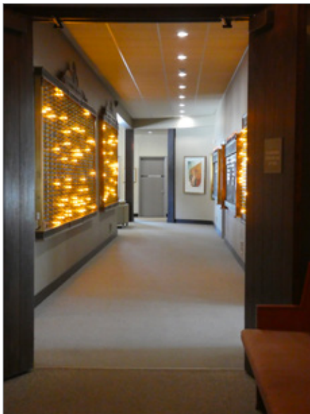
FIG. 2. ENTRANCE TO THE MEMORIAL LOUNGES FROM THE SOUTHEAST. | SHARON GRAHAM, FEBRUARY 2021.