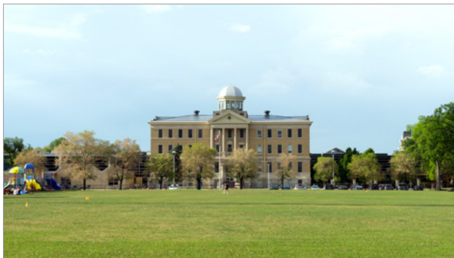
FIG. 12. ASPER JEWISH COMMUNITY CAMPUS, 123 DONCASTER STREET, WINNIPEG, MB.