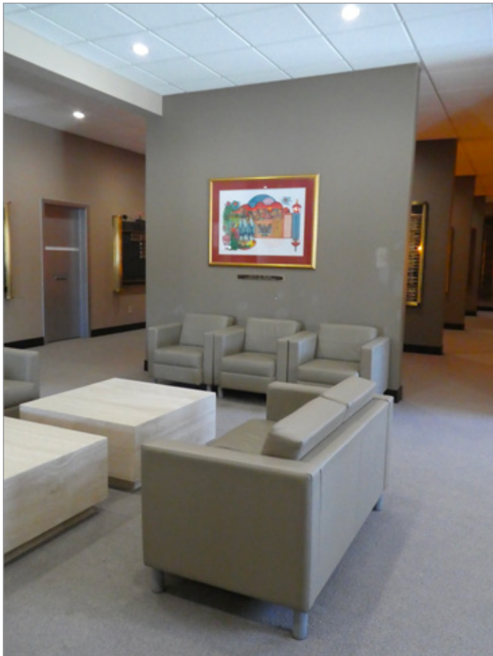
FIG. 1. ENTRANCE TO THE MEMORIAL LOUNGES FROM THE NORTH. | SHARON GRAHAM, FEBRUARY 2021.

Historical examinations of buildings can be performed by a detailed analysis of stylistic elements. However, in the case of the memorial rooms of the Etz Chayim synagogue, there are very few stylistic elements to choose from; they are simply a number of rooms constructed out of drywall. In the case of these elements of the synagogue on 123 Matheson Avenue East, it is best to view the purpose and use of these rooms as their most