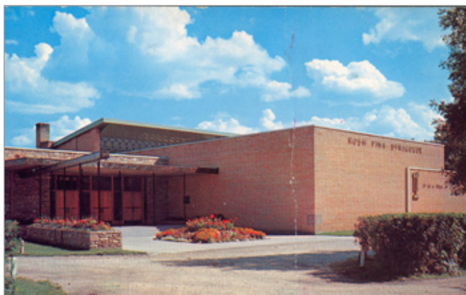
FIG. 9. EXTERIOR OF ROSH PINA SYNAGOGUE AS IT APPEARED ON A 1970S COMMEMORATIVE POSTCARD.