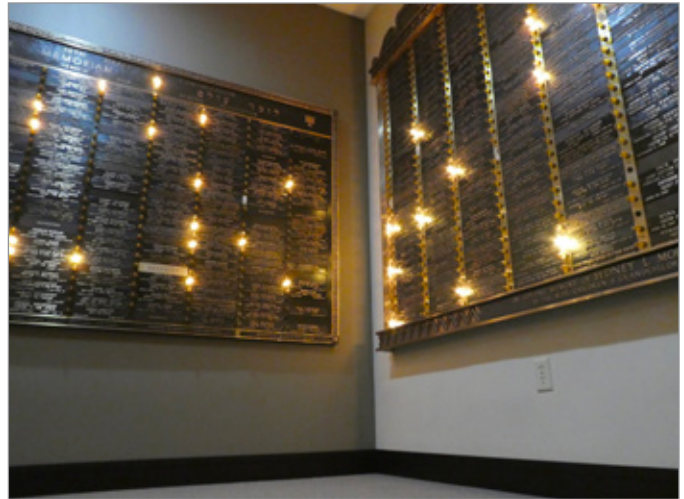
FIG. 6. A CHILD'S PERSPECTIVE IN A MEMORIAL LOUNGE ROOM.

there are plenty of classrooms and play spaces in this synagogue, including one spacious room in the basement with floor hockey equipment. Instead, they were meant as a compromise that would allow the members of the three merging synagogues feel as though they were acknowledged in the new Congregation Etz Chayim, which uses the former Rosh Pina building. Ensuring that the rooms for the memorial boards existed in a visible part of the synagogue was an integral part of the merger negotiations. 10 It seems, however, that this hanging of the memorial boards in their own rooms has resulted in removing them from the main spaces used by the congregation. At another Winnipeg synagogue, Congregation Shaarey Zedek, the memorial boards are located in the chapel which adjoins the main sanctuary and is used for many prayer services, allowing regular worshippers to sit in a pew which is close to their relatives' names on the boards. At the Winnipeg synagogue Adas-Yeshurun Herzlia, the memorial boards are hung on the back walls of the main sanctuary. Though the boards are too high up on the wall to see, the ancestors of members are included in the main prayer