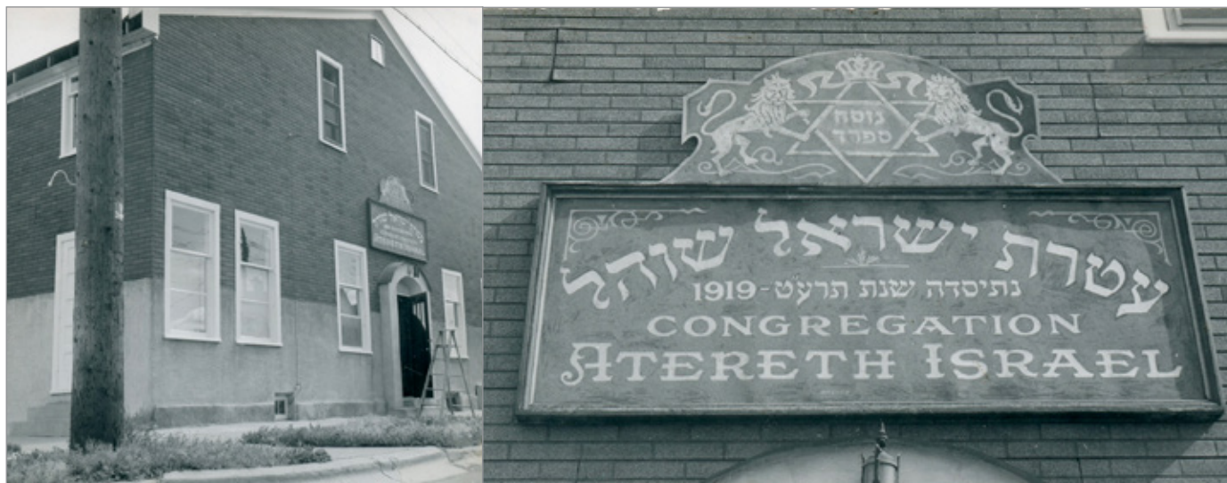
FIG. 11. EXTERIOR AND SIGN OF ATERETH ISRAEL SYNAGOGUE (1919), 469 MAGNUS AVENUE, WINNIPEG, MB. | JEWISH HERITAGE CENTRE OF WESTERN CANADA; PHOTO JM 2658-5.

amalgamating throughout the late nineteenth and early twentieth centuries, when Jewish immigration to Winnipeg was in full flow.