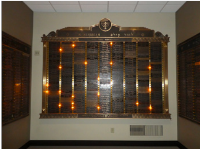
FIG. 5. EXAMPLE OF A MEMORIAL PLAQUE. | SHARON GRAHAM, FEBRUARY 2021.