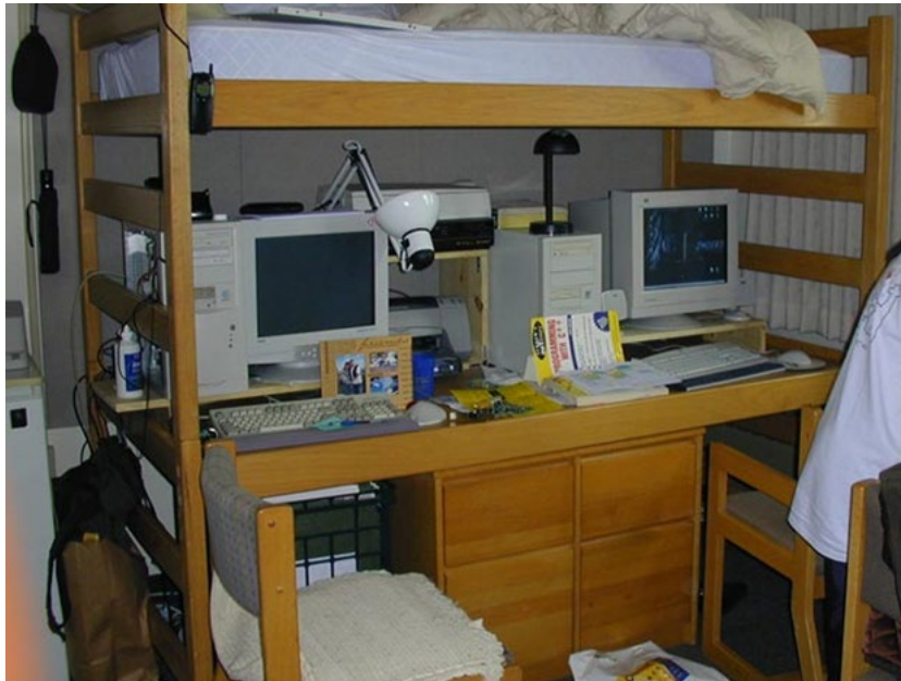
Figure 2: the "secret crunchyroll headquarters" listed on the about page of Crunchyroll, circa 2006: < https://web.archive.org/web/20060720164133/http://www.crunchyroll.com/about >