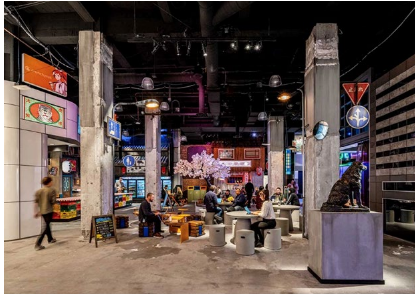
Figure 3: a photo of Crunchyroll offices listed on Crunchyroll's about page in 2020. Available from: < https://www.crunchyroll.com/about/index.html >

literally in the transformation of space, from Crunchyroll's origins in a cramped college dorm room (Fig. 2) to an expansive post-modern pastiche of Shibuya, Japan (Fig. 3). Such an expansion of space is predicated on the exploitation of labour, from unpaid fan labour during their piracy days, to Crunchyroll's current system of underpaid translators today (The Canipa Effect, 2020; 2022). Through its history of converting fan labour into industry legitimacy, Crunchyroll offers unique insight into the ways in which streaming platforms operate today.