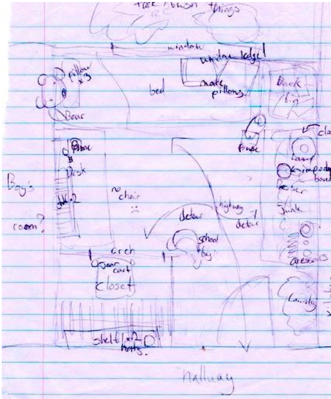
Figure 1. Victoria's map of her bedroom

During our interview, Victoria described her map to me: