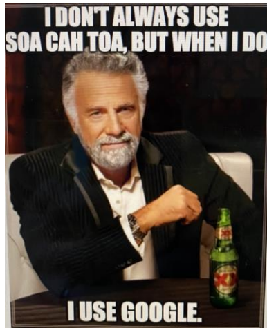
Figure 2. A Meme About Using Google to Understand Math