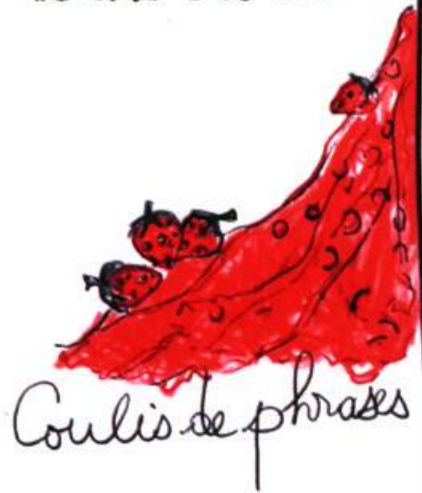
Coulis de phrases