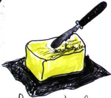
Livre de beurre