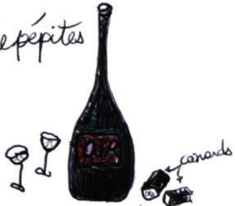
Eau de vie