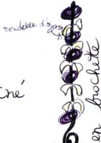
Dan'P torticoli en brochette