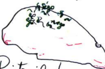
Portrait de poulet à l'estragon