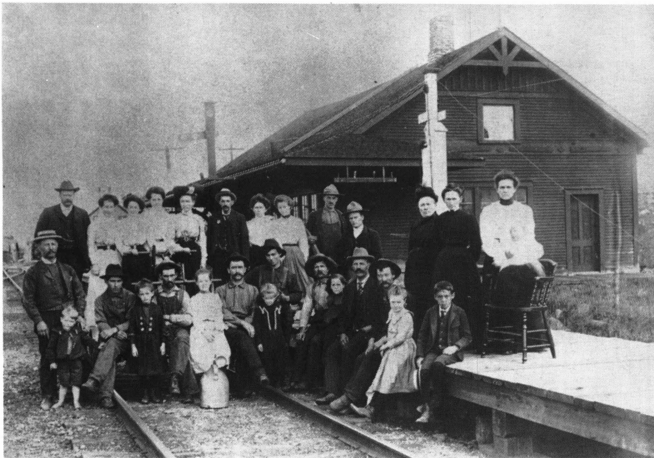
Milan, CPR Station, 1903. A group of Scots Canadians with three unidentified railway workers and a French-Canadian man (first four seated from the left) at a small station between Scotstown and Lake Megantic. The arrival of the railway in 1879 brought a rapid decline in the Scots community.