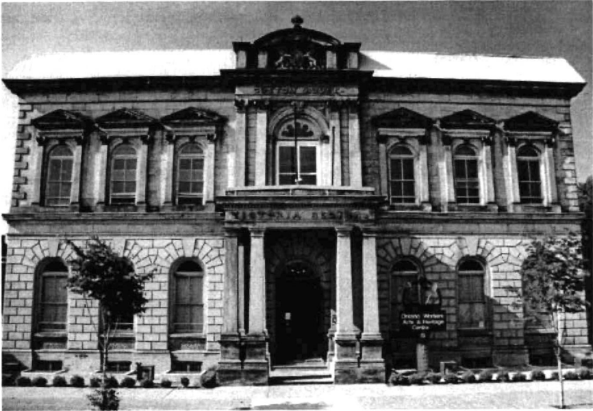
The Ontario Workers Arts and Heritage Centre (formerly Hamilton's Custom House, built in 1860).

skills to dig deeper into a specific subject. 22 They also recognize the need to communicate to the less well-informed, just as in their undergraduate classrooms or their talks to labour audiences. From its earliest 19th-century forms, the museum was always seen as an educational tool that paralleled other forms of cultural diffusion such as public schools, and, however much museum practices have changed, the didactic, educational role remains predominant. Yet, for the historian, in many ways, the move into public history has meant stepping onto a stage where the script and stage directions are much less familiar. A few historians have worked sporadically with local history societies and museums, and some have begun to teach courses in public history to undergraduate and graduate students. But most university-based historians have never done this kind of work, nor been trained to undertake it. Moreover, it is not highly valued within the academic reward system of tenure and promotion, nor supported by most agencies of scholarly funding. 23