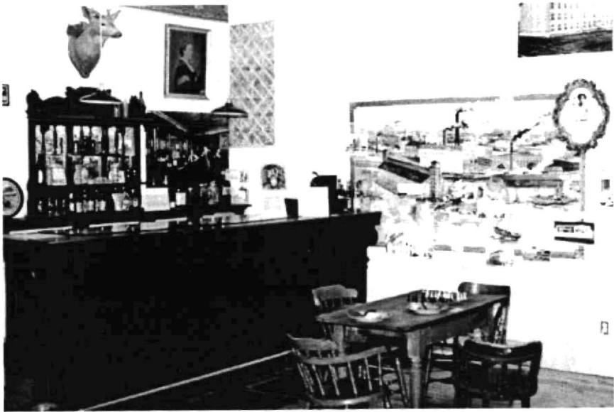
A turn-of-the-century saloon in the 1998 OWAHC exhibition "Booze: Work, Pleasure, and Controversy."

the chance to contribute to a catalogue or handout, but the space is limited, and the prose must be sparse. They are exhorted not to write out their books on the wall, since visitors to heritage installations have little tolerance for excessive wordiness. 60 Most of their written contributions to public history are short paragraphs mounted on text panels alongside or embedded within a display. Far more of their analysis must be communicated visually (or perhaps orally) through the selection and presentation of artifacts, the arrangement of space within the exhibition, and the use of lighting and sound. Museum installations are also increasingly interactive, involving hands-on contact with displays and access to CD-ROMs, interactive videos, and motion-activated lighting and sound. Historians' expertise rarely extends to these media. As an American museum administrator has suggested, "an exhibition or a historic site is much more than the written text of labels and conveys much more complex information through spatial relationships, visual images, real things, and social interactions in a three-dimensional environment that is social, multisensory, and largely self-directed." 61