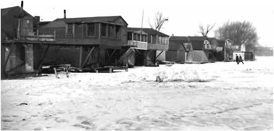
Figure 4. Boathouses in the winter, with people walking on the ice of the bay, 1930. According to stories told by local old-timers, boathouse children would skate across the bay to attend public school in the city's North End during the winter months. Kerosene heaters kept boathouse homes warm in the winter.

ries of aerial photographs taken by the famed local aviator, Jack V. Elliott in 1928, like the one found in Figure 2. 19 Elliott's photographs show a pattern of about 120 contiguous buildings running alongside and into the canal on both its bay and marsh sides. Other photographs taken from land and the water in the 1920s and 1930s show the boathouses as typically two-story buildings, some of which stood atop stilts over the water. As can be seen in Figures 3 and 4, several of them appear to have been fairly substantial, housing boats downstairs and people above. Second-story porches overlooking the waters provided great sunset vistas and a handy diving platform for swimmers. Perhaps because of this design, only occasionally, like during severe storms, did water get into the living quarters. 20 Not all places, however, were so comfortable, as in the case of the shack pictured in Figure 5.