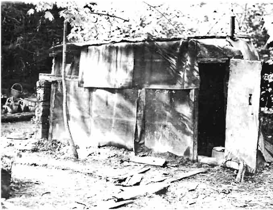
Figure 5. Shack in Cootes Paradise across from Raspberry House near the railway, nd. This tin shack is an example of the lower end of the scale of makeshift housing found near the Desjardins Canal area. Raspberry Farm, on the north shore of Cootes Paradise now houses the Royal Botanical Gardens Arboretum and Lilac Dell.

The boathouse community, therefore, was a product of Hamilton's rapid industrial growth during the first two decades of the 20th-century, at a time when social and political leaders promoted their city vigorously as the "Birmingham of Canada." They supported the creation of the Hamilton Harbour Commission in 1912 by a Special Act of Parliament to help local industry through a program of land reclamation and port development. Local boosters supported the filling in of swampy inlets and ravines on the harbour's southeastern shoreline for waterfront industrial locations, and built wharves for shipping raw materials and industrial goods. On the eve of the World War I, the city contained more than 100,000 people — nearly twice as many as were there just a decade before. One-half of Hamilton's workers were employed in some 400 factories, located mostly on the waterfront in