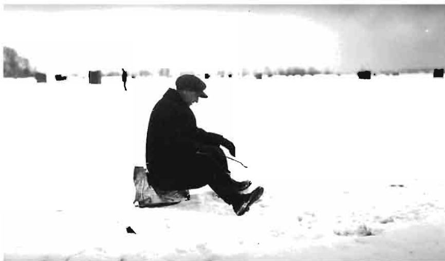
Figure 8. Ice fishing on Burlington Bay with a hand line, 1920. Every winter working-class Hamiltonians fished through the ice on the frozen western portion of the bay between the Desjardins Canal and Carroll's Point near the boathouses to feed their families. This area was typically covered with ice huts during the winter months; however a few souls, like the man pictured above, made do with whatever was at hand.

not need much prowess to hunt successfully and count on a good bag. 36 The area had everything — sunfish, catfish, shiners, bass, carp, ducks, partridges, woodcock, snipe, muskrats, deer, and other plentiful game.