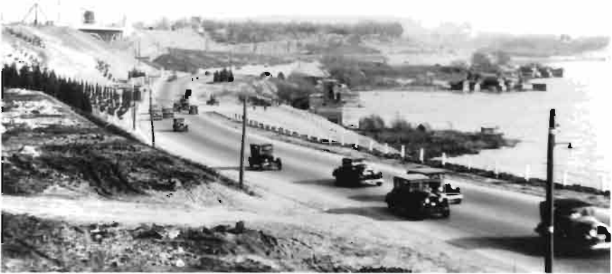
Figure 10. The view of Cootes Paradise boathouses from the highway, c. 1931. The cars in the foreground are travelling out of the city on Longwood Road along the shoreline of Cootes Paradise. In 1928 the Parks Board created a design contest for architects to develop a beautiful new north western entrance to the city.