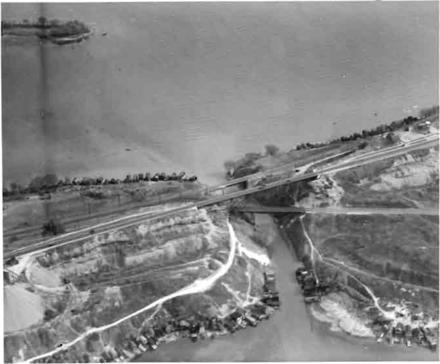
Figure 2. Aerial shot of Hamilton's boathouse colony showing the houses along the shores of the Burlington Bay, the Desjardins Canal, and Cootes Paradise, 1928.

lines across the heights. The natural outlet of the Desjardins Canal was filled in, replaced by a new channel dug through the middle of the landmass. 16