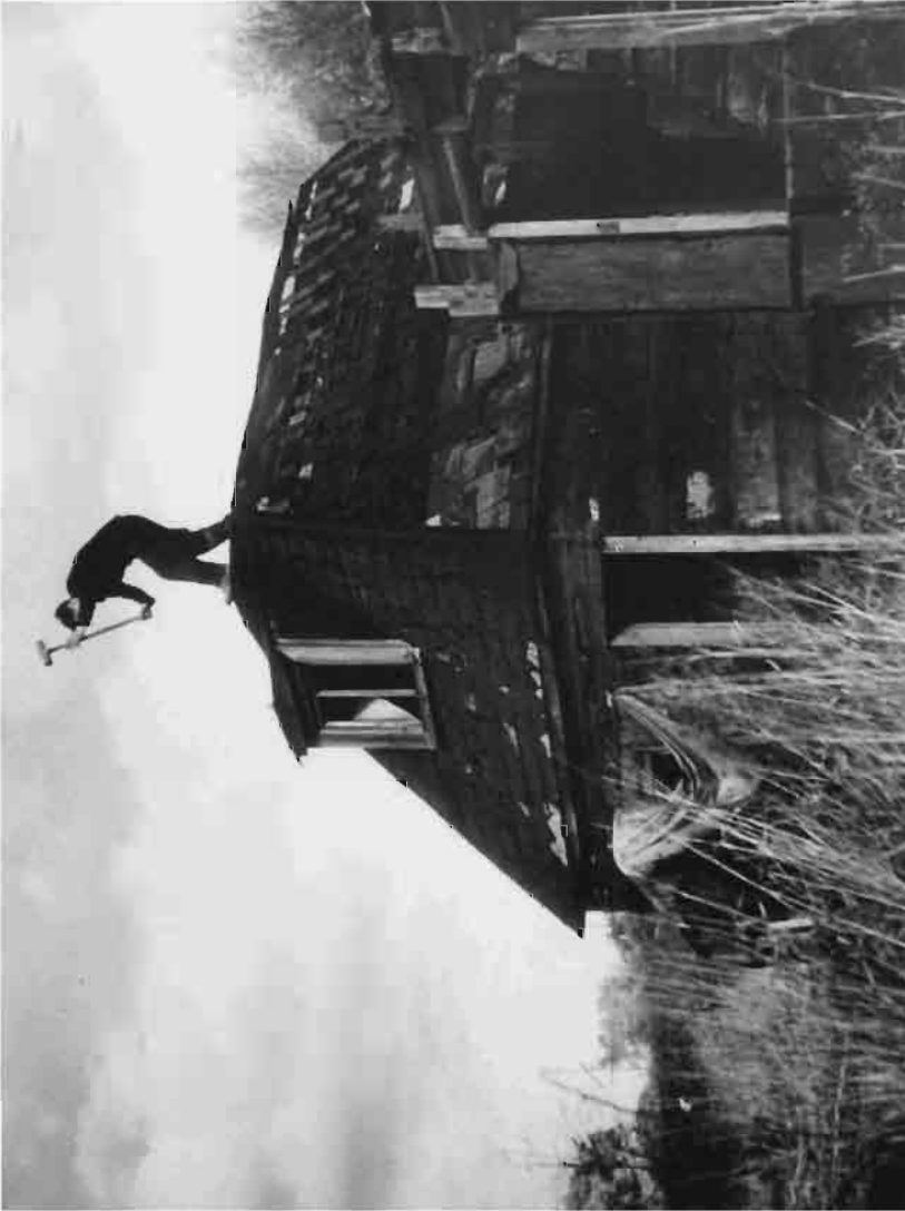
Figure 12. Demolishing a Boathouse.