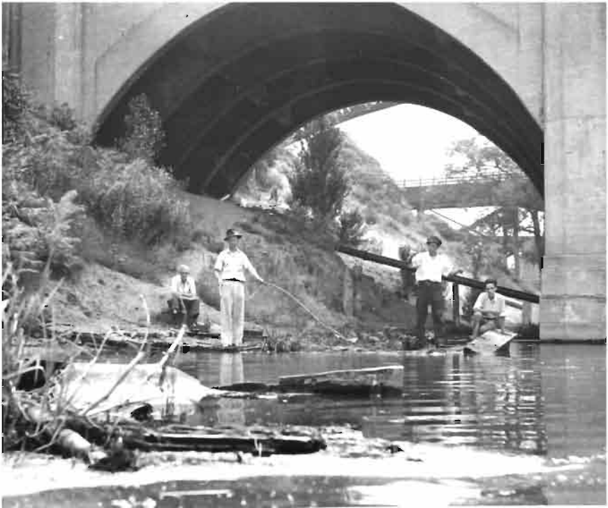
Figure 7. Men fishing under the Longwood Bridge at the Desjardins Canal. These fishers appear to be on the northern shore of the canal under the bridge that eventually made way for the building of the 403 highway in the early 1960s. Today fishers still frequent the area, but they do so typically on the opposite shore, along the city's new waterfront trail near a barrier that prevents carp from entering Cootes Paradise.

bridge provided a superb platform for their well-executed dives and spectacular, wave-crashing cannon balls. 35