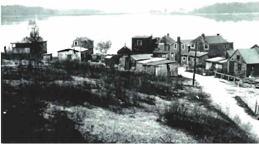
Figure 3. Boathouse homes on Dundas Marsh (Cootes Paradise) just before their demolition, c. 1936. The first building on the left side of the road has been identified by an old-timer as the Owls club house, a place for boys in the area who hung out there, sneaking smokes and the odd drink of beer.

quired to construct a third rail line across the heights in the 1890s, photographs from the period still do not show any dwellings along the shore. 18 Instead, the photographic record would suggest that the boathouse community emerged sometime during or after World War I, likely in response to serious housing shortages in the city. The best and most complete visual record of the boathouses comes from a se-