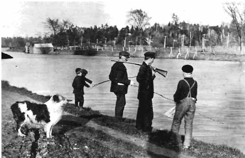
Figure 6. Pot Hunters at the Canal basin, Dundas. Using shotguns and homemade fishing poles to bag their catches, working men and their families of the boathouse colony survived on the plentiful game in the area until the designation of Cootes Paradise as a bird and wild-life sanctuary in 1927.

nocuous activities for kids of the area. “It seems to simply swarm with children,” a reporter from the Herald noted approvingly in 1924, at a time when Hamilton, like many other urban places throughout the country, wrestled with the problem of determining what sorts of recreations were morally appropriate for the city’s youth. Recreational programs sponsored by the parks board aimed to get kids off local street corners and into socially-sanctioned activities on supervised grounds. The area provided “a great natural playground” for them. The Herald argued that overall, kids living in the boathouses did not do all that badly by their unsupervised surroundings. For example, they fared quite well when it came to nautical pursuits, and they swam far away from Hamilton’s dangerous industrial waterfront and its busy wharves that so concerned city officials. 34 Clad in makeshift bathing suits (though more often au naturel ), they took to the water at a very young age. Many were said to be experts in swimming back and forth between the canal and Carroll’s Point on the north shore. This activity helped certain boys on to victory in Hamilton’s annual Playground Association Swimming Championships. Best of all, the high level