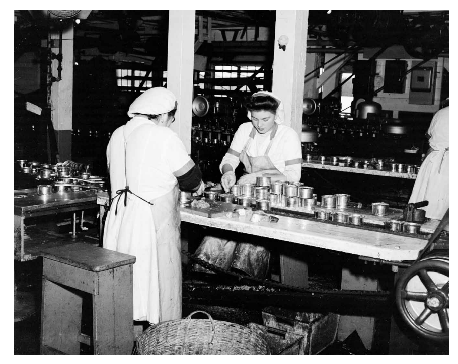
On the canning line at Inverness Cannery, Skeena River, 1947 IMAGE I-28895

fishing off the Panhandle.<sup>24</sup> As well, a 1951 rock slide on the Skeena system further compromised the sockeye by blocking access to their main spawning grounds at Babine Lake.<sup>25</sup> Fisheries officials only learned of the slide late in the season, and did not send crews to clear it until the following spring. Fisheries scientists estimated the slide killed 75 per cent of the 1951 spawners. Although the slide did not affect pinks to the same degree (it occurred above the main pink spawning area), catches for that species had been declining since 1930. Despite acquiring more efficient technologies such as nylon