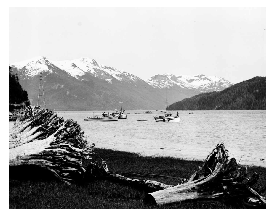
Fishing boats on the Skeena River, 1954 Image I-22258 courtesy of royal BC museum, BC Archives, Photographer: BC government

Dianne Newell's Tangled Webs of History has provided a valuable overview of state policies and industrial transformations from the late 19th century to the 1980s, we know little about localized regulations, and the interactions between fishers and officials.<sup>5</sup> Second, the protests will help us explore the larger question of Aboriginal identity, work, class and politics raised by others, including John Lutz and Andy Parnaby.<sup>6</sup> The native gillnetters were protesting during a period of heightened Aboriginal rights activity in the province, and many of the leaders were also involved in other areas of native politics. When the native fishers wrote their letters to the Skeena Salmon Management Committee, they often spoke about their heritage and their historic connections to the resource. At the same time, however, they also revealed aspects of a class politics, identifying as gillnetters, small-boat fishers operating in a