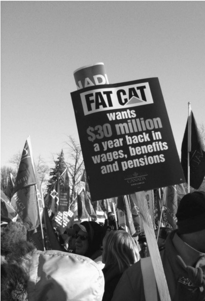
Protest sign detailing the concessions demanded by Caterpillar.