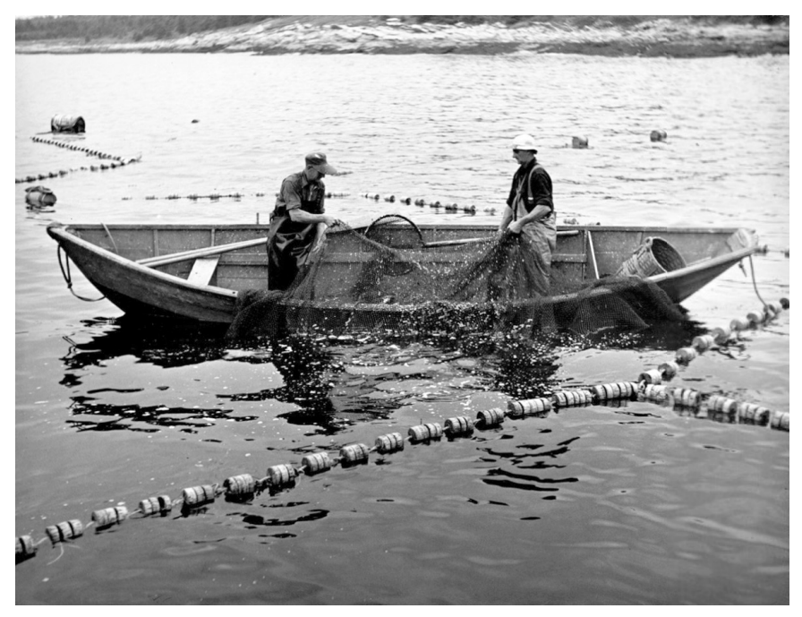
Arthur Griffin, "Christmas Cove, Maine, Sardine Fishing Brining in the Sardines," 1944.

from the local weir fishermen, who wholly controlled the supply, that they were forced to pay the fishermen, according to US Fish Commissioner Hugh Smith, "a very much larger figure for their fish than the business will warrant."<sup>52</sup>