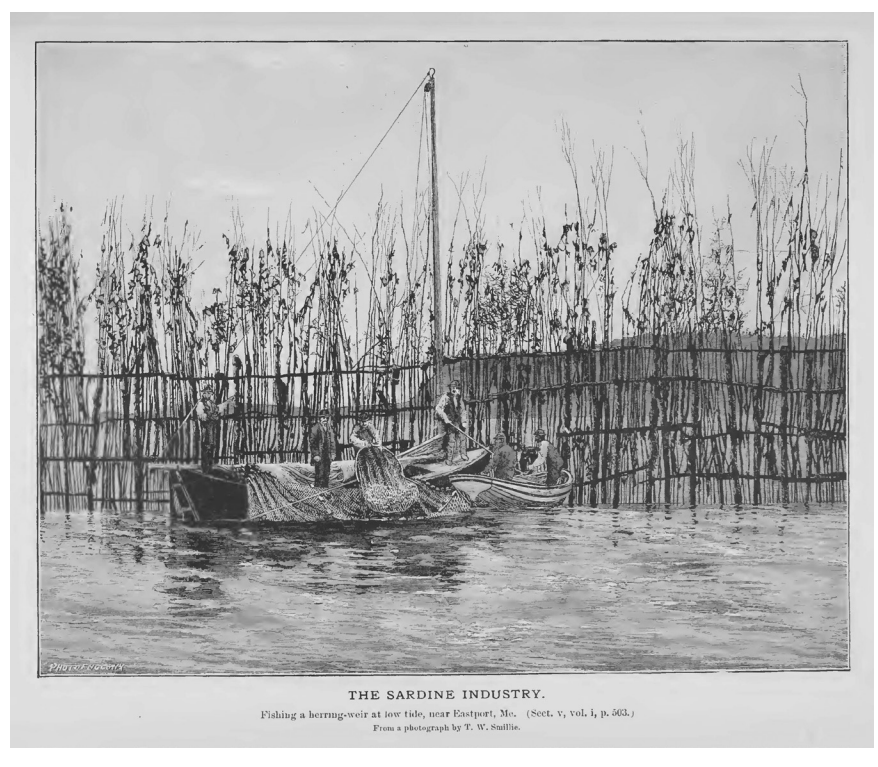
"The Sardine Industry. Fishing a Herring Weir at Low Tide Near Eastport, Me." In George Brown Goode, The Fisheries and Fishing Industry of the United States. Section V: History and Methods of the Fisheries, Plates (Washington, DC: Government Printing Office, 1887), 503.

Independent, subcontracted boatmen – many of whom (like the weirmen) were Canadian – then ferried those fish from the weirs to the canneries in Maine. There, cannery workers – predominantly female wage workers – steamed or baked herring fish and then packed individual fish in cottonseed oil, mustard, or tomato sauce. Cases of 25 of these sardine cans were then packed for shipment. The process of canning herring and marketing them as sardines thus began with an individual who had deep working knowledge of the environment from which the resource was extracted; utilized several levels of independent, subcontracted labour; and finished the production with in-house seasonal wage workers.