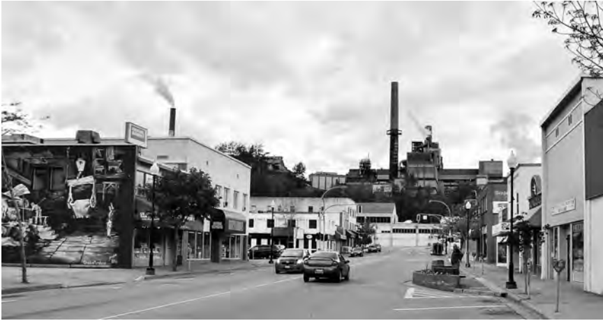
Trail today with Cominco smelter overlooking the city. Mural (left) shows lead furnaces where many workers suffered industrial diseases such as lead poisoning.