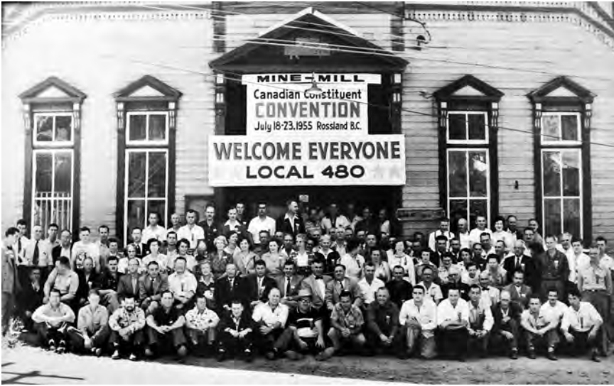
Local 480 hosted the founding convention of Mine-Mill Canada in the historic Rossland Miners' Union Hall, built by Local 38 of the Western Federation of Miners, Mine-Mill's predecessor, in 1898.