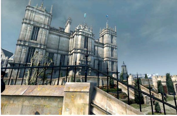
Figure 7 - Dunwall Tower in the opening prologue of the game. The player is unable to progress past the steel fence, but is allowed to explore a small area outside.