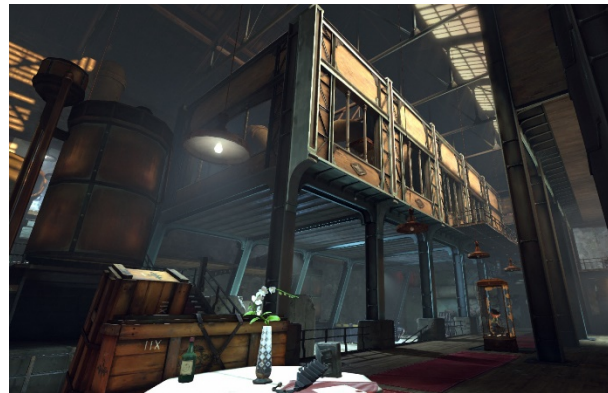
Figure 6 - The interior of Sokolov's Safehouse. The warehouse has been repurposed, and the new steel structure appears like a foreign life form tentatively hovering within the space.

in the context of our subsequent assertion that architecture is reflective of the morals of those who build and dwell within it. The following architectural examples in Dishonored demonstrate how architecture is used as visual metaphor for important characters to convey information about the game's main characters, similar to how architecture is utilized in other visual media.