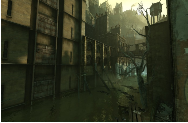
Figure 13 - Submerged warehouses and refineries litter the Rudshore Waterfront in the Flooded District, inhabited only by hostile river creatures and infected plague victims.