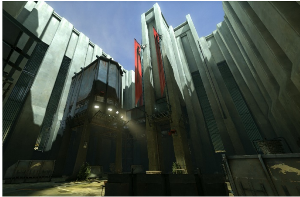
Figure 3 - An Internal courtyard of Coldridge Prison