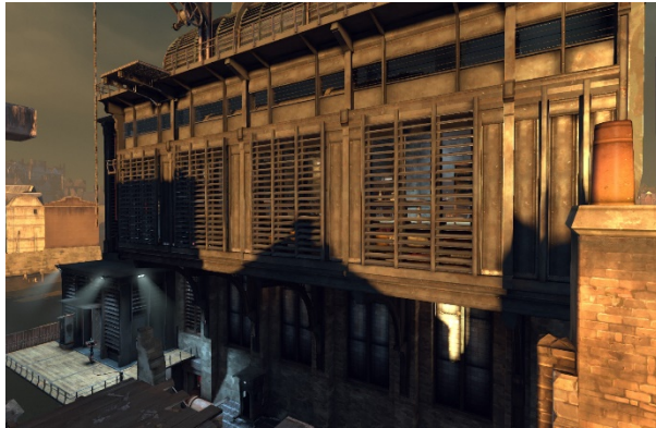
Figure 5 - The external façade of Sokolov's Safehouse. The steel structural addition is attached to the original brick façade by enormous metal corbels, casting it in shadow while the addition is allowed full solar access.