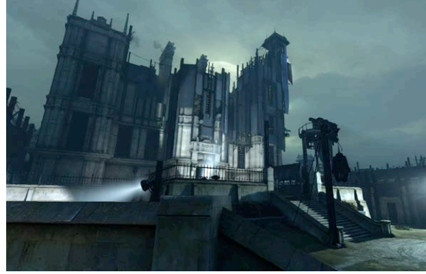
Figure 8 - Dunwall Tower following Hiram Burrows' rise to power. The lighting serves to emphasise the building's menacing visage.