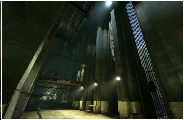
Figure 4 – An internal hallway in Coldridge Prison.