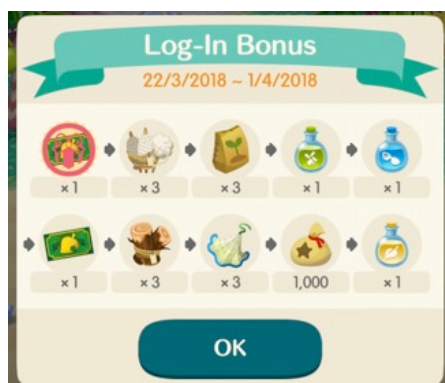
Figure 6 – An example of 10 days’ worth of log-in bonuses. The game is clearly happy to reward players for their engagement, however modestly.

Consider, once again, some key points about Pocket Camp ’s gameplay. If a player is willing to wait for objects to be built, they need not spend Leaf Tickets. This in itself is not a major revelation. But in actual fact, if a player is patient enough, they need not even harvest fruit, catch fish, or befriend animals. With the resources the player is given at the start of the game along with the daily log-in bonuses one receives, a player could access most of the game without ever taking part in the game’s repetitive, labour-like chores (see Figure 6 ). Since Pocket Camp turns natural resources and indeed friendship into currencies, the player can acknowledge this and refuse to receive that ‘waged labour’ in kind, and instead opt to wait for the game to give them enough materials to continue.