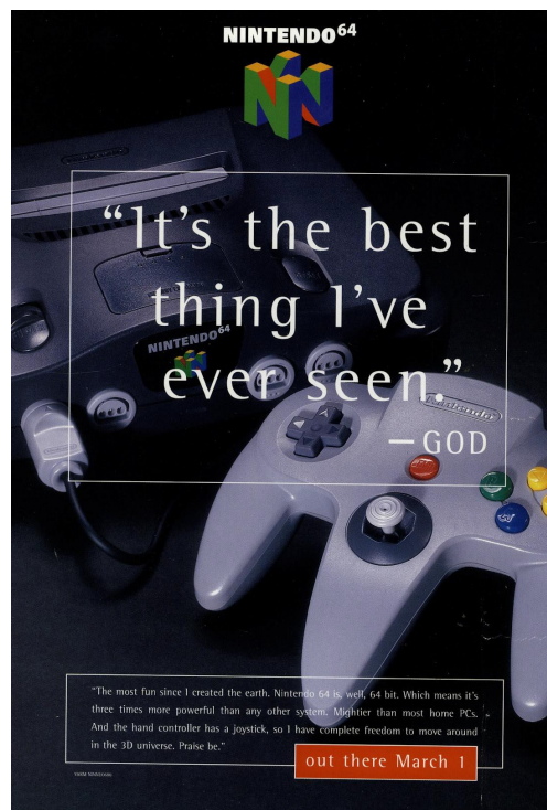
Figure 1.2. Nintendo 64's 3D joystick, sight, and feeling "complete freedom"