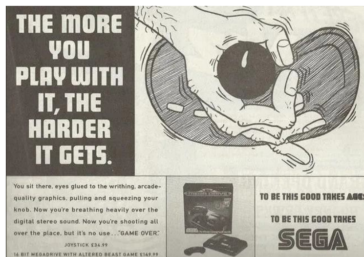
Figure 1.5. Sega mega drive advertisement mapping self-masturbatory phallic play and death to the joystick

Yet entering text into Animal Forest requires that players to navigate both phallic and clitoral analogues by pairing rhythmic button presses with rotating and flicking the joystick, a feeling of writing that is disruptive to historic narratives of writing as a strict analogue for cisgendered male sexual activity. As Phillips concludes, such observations are merely disruptive as they still perpetuate in a problematic gendering of gameplay and game hardware; however, given the largely heteronormative cisgendered rhetorics circulated about players, hardware, and writing, the feeling generated by Animal Forest's writing system presents an important rejection of these analogues.