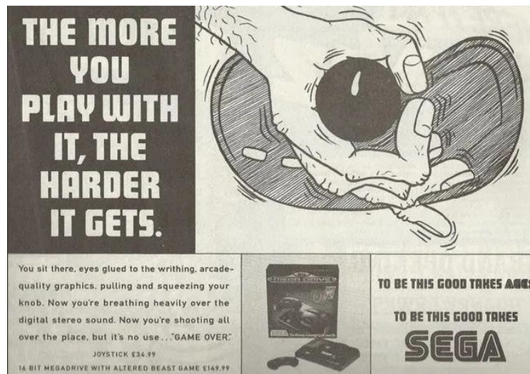
Figure 1.5. Sega mega drive advertisement mapping self-masturbatory phallic play and death to the joystick

Yet entering text into Animal Forest requires that players to navigate both phallic and clitoral analogues by pairing rhythmic button presses with rotating and flicking the joystick, a feeling of writing that is disruptive to historic narratives of writing as a strict analogue for cisgendered male sexual activity. As Phillips concludes, such observations are merely disruptive as they still perpetuate in a problematic gendering of gameplay and game hardware; however, given the largely heteronormative cisgendered rhetorics circulated about players, hardware, and writing, the feeling generated by Animal Forest's writing system presents an important rejection of these analogues.