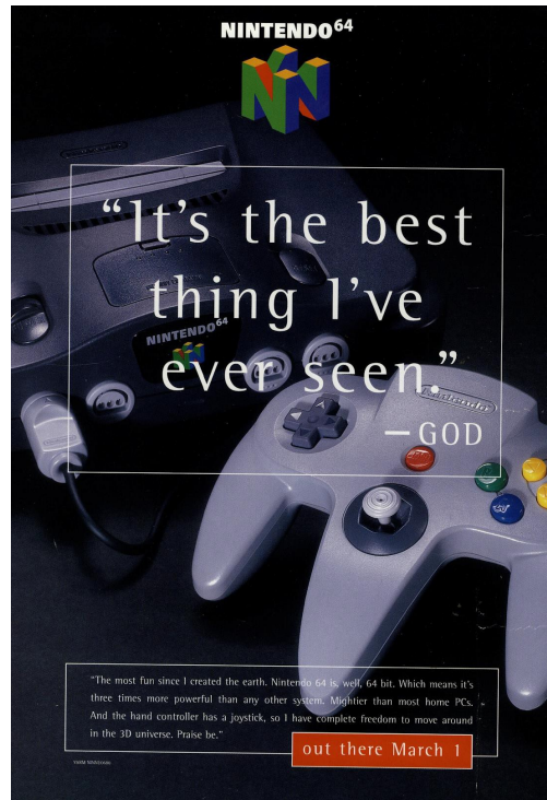
Figure 1.2. Nintendo 64's 3D joystick, sight, and feeling "complete freedom"