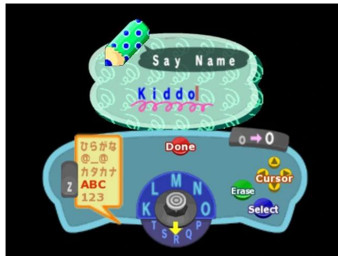
Figure 1.1. Dial Input Writing System in Animal Forest

In addition to this ring, the controller buttons are represented in the location that they appear on the player's controller with labels to indicate how they may be used to write and edit text (excluding the L trigger and directional pad). On the input dial itself, a set of five letters and symbols are mapped to the joystick's horizontal, upper-diagonal, and upper-most inputs, allowing the player to enter a letter or symbol by circling the joystick in the direction that it is assigned and pressing the A button for "Select." Pressing down on the joystick allows the player to access a different set of five letters and symbols, and players can scroll through series after series of five letter/symbol chains this way. The camera buttons serve as arrow keys for moving the cursor between letters, and B and A buttons allow players to Erase and Select letters respectively.