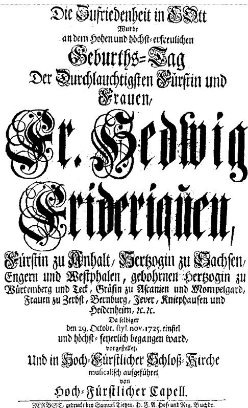
Figure 1: 'Die Zufriedenheit in Gott', libretto to Praise the Lord O my soul by J. F. Fasch, Zerbst, Franciscum Library; A. 11. m., fol. 39, no. 5