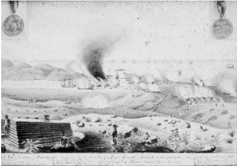
Illustration 1: Thomas Davies, A View of the Siege of Louisbourg , 1758 (National Gallery of Canada).

benefit of the mother country. As well, when Colville painted holocaust victims (1946) he was reflecting on issues of international law and justice in the precise vision of his style of painting. In all of this the artist's mission was to record and comment on war as that mirror that reflected contemporary life about which conflict was but one aspect. The work of Thomas Davies remains an aspect of the eighteenth century that recorded British war with the French in a framework that showed the capability of nations toward cultural achievement even when preoccupied with the realities of war.