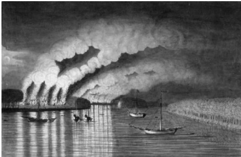
Illustration 2: Thomas Davies, A View of the Plundering and Burning of Grimross , 1758 (National Gallery of Canada).