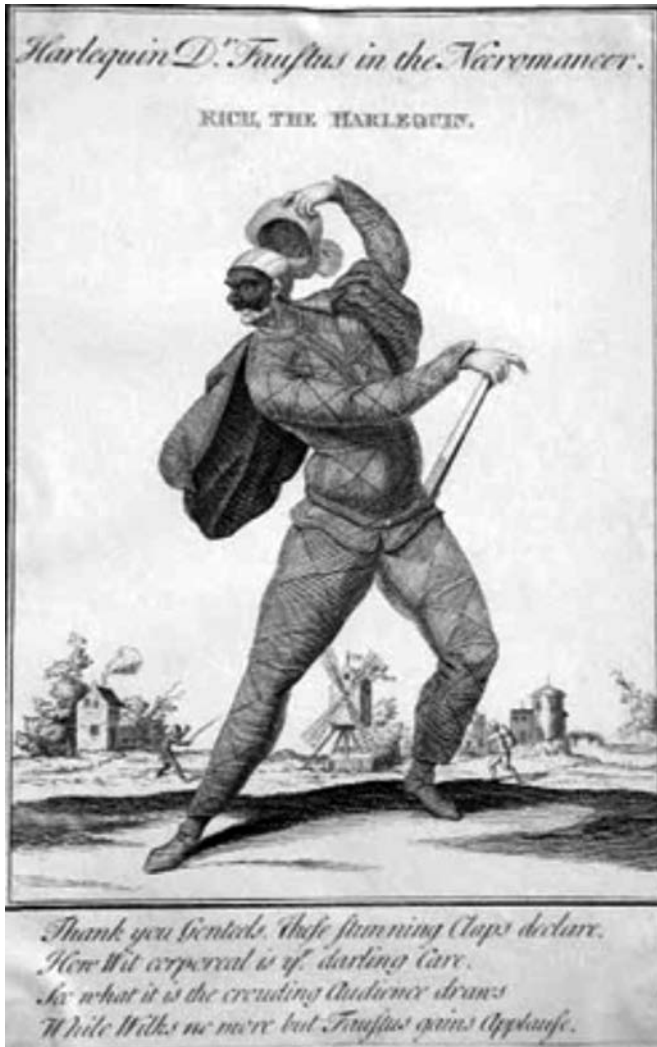
Illustration 1: Forged engraving of John Rich in The Necromancer . Undated (courtesy of the Collection of the Art Archive / Garrick Club, PM0154).