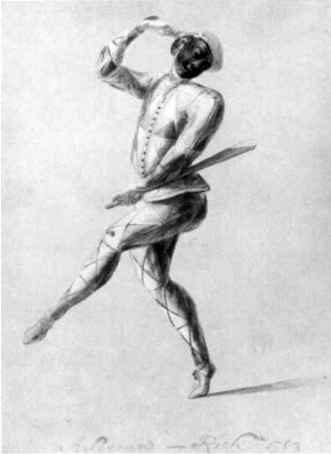
Illustration 2: John Rich in 1753. Artist unknown.