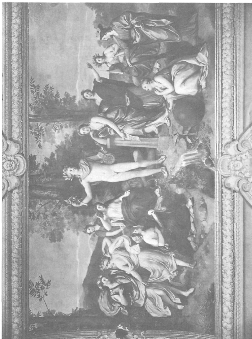
The Parnassus Fresco of Apollo, Mnemosyne, and the Nine Muses: Villa Albani (now Torlonia), Rome

Mengs slips into this position more by way of practical, pedagogical concerns than of carefully argued, philosophical reasons (1:40, 78), the problematic import for theory of art is still serious: canonic art becomes essentially a kind of palimpsest.