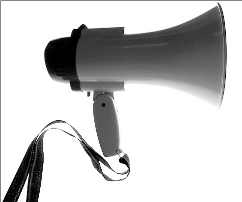
Fig. 2 An example of a transistorized megaphone similar to the one examined for this paper. Note the plastic material, expanded circumference of the larger end of the cone, and the small button located behind the handle which must be pressed to activate.

significant technological modifications which served to improve and enhance its capabilities. This megaphone was examined primarily by following the steps proposed by Prown (1982) and Fleming (1974) in their respective studies, both of whom outline a theoretical model for conducting object-based studies in the field of material culture. In terms of design modifications, the more modern megaphone (Fig. 2) is composed of entirely different materials in that it is made of plastic, rather than tin, wood or papier-mâché. Second, it is an altogether larger device, especially in terms of the circumference of the wider end of the cone, which ostensibly increases its capabilities for amplifying sound. Third, and most importantly, this megaphone is transistorized, meaning it has been constructed to operate with the aid of batteries.