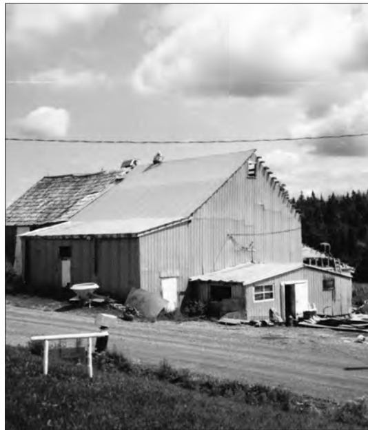
Fig. 11 & 12 Left: The Archibald’s 19th-century timber-framed barn, in the process of being torn down, 1983. Below: The Archibald’s modern free-stall barn.

How should we conceptualize built heritage? Historic buildings in St. Mary’s are assigned meanings that subvert the authorized heritage discourse and attest, rather, to the fluidity of heritage, and to the value of the intangible contexts of buildings. Understandings of intangible cultural heritage that engage with the tangible usually involve the knowledge and skills to produce traditional crafts like architecture, but not the material products themselves. However, ICH focuses on more fundamental actions and attitudes. And the UNESCO convention on ICH acknowledges that intangible heritage “thrives on its basis in communities” and that it