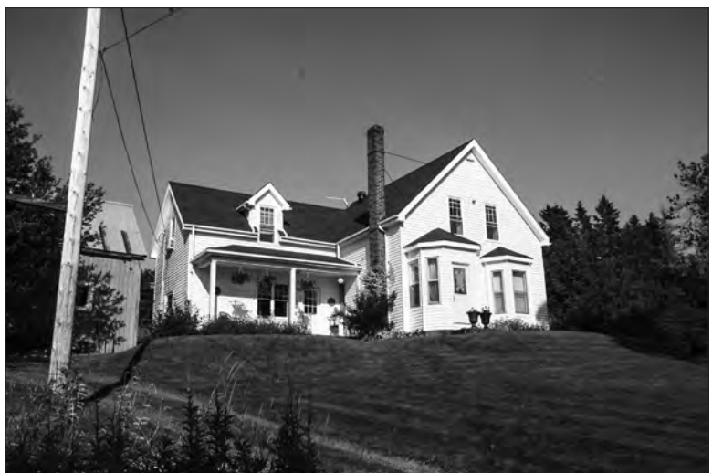
Fig6. 7, 8 Above top: The Fisher farmhouse in 1910, with original architectural details. Above: The Fisher farmhouse today. The alterations to character-defining details are clearly evident.