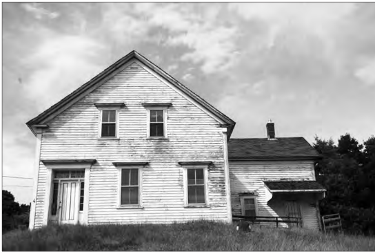
Fig. 5 The Gunn farmhouse, East River St. Mary's, ca. 1880s.

Cultural institutions like ICOMOS (International Council on Monuments and Sites) or UNESCO (United Nations Educational, Scientific and Cultural Organization) and their various charters, provincial and municipal heritage property acts, and museum conservation efforts solidify the historic fabric of a building as the prerequisite of significance. Expert, connoisseurial knowledge, policy and planning statements, and official designations claim authority over landscapes, arbitrating authenticity and meaning. Built heritage, like nature, becomes a resource that must be managed and preserved in