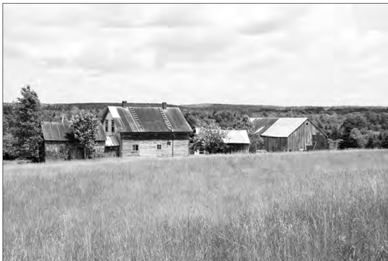
Fig. 6 Rear view of the Cumminger farmstead, Aspen.

appropriate ways. In this authorized discourse, heritage is innately valuable and meaningful, but it is seldom considered active or changing, or part of an ongoing, dynamic process. Historic architecture, then, becomes a cultural good that is open to critique and comparison, and where value is assigned based on notions of “beautiful” and “ugly,” “authentic” and “inauthentic,” “exceptional” and “ordinary,” “worthy” and “unworthy.”