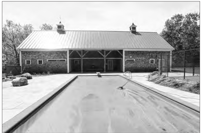
Figs. 3, 4 Above middle: The Archibald barn in Glenelg, ready for disassembly. Above: The barn's frame in its current form as a pool house in the Annapolis Valley – 300 km away from its original location.