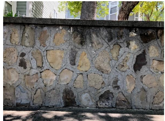
Figure 11 Stone and concrete retaining wall (detail), built by Italian Service Unit men, Benicia, California. Photograph by Laura E. Ruberto, 2021

Collectively made secular spaces and structures were also common. Italians shaped much of the general landscape of the camps and in some cases even constructed camp buildings. A handful of hardscape work, sometimes decorative, other times practical, is still in existence and mark those local territories by the historical realities of the people who were there before them, becoming a quiet but visible cultural heritage presence of the POWs. These structures include a fountain and a sculpture near Honolulu, HI, a sculpture at Camp San Luis Obispo, CA, a fountain at Camp Roberts, CA, a brick wall near the former camp in Benicia, CA, and a now-dismantled “Star of Hope” fountain at Fort Benning, GA (Coker and Wetzel 2019, 100).