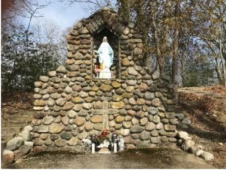
Figure 9 Altar, built by Italian Service Unit members, near Taunton, MA.

Christmas afforded a heightened opportunity for creative expressions around religious traditions more commonly associated with Italian families; actions that were adapted for the entire camp and even the community beyond the camp. Such adaptations to the dislocated space of the POW camp places them in line with Italian diasporic traditions, a point well illustrated through the bricolage and hybrid creations by POWs of presepi . The uniqueness of Italian POW nativity scenes aligns them very much with the ways Joseph Sciorra discusses the miniature Christmas landscapes found in Italian New Yorkers' homes, noting them as an ephemeral "fantasyscape ... enlivened by narrative and performance in the service of Christian pedagogy, autobiography, and family history, and the engendering and strengthening of community affiliation" (2015, 63). The POW- presepi illustrate some of the ways that craft and design helped men express their faith, share in cultural traditions, abate nostalgia or loss for home and family, and at the same time bear witness to the unique moment they were living. In 1943, in the POW camp in Douglas, WY, prisoner and sculptor Giannino Gherardi worked on the creche in his barracks which in his