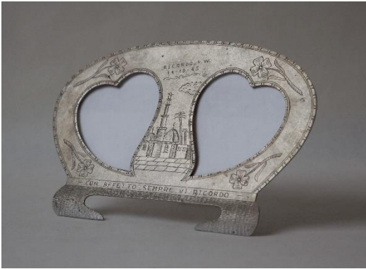
Figure 5 Italian POW-made photo frame, artist unknown.

intentionality of the builder through imagery and inscriptions. Many tin cigarette holders, small wooden boxes and other mementos have images that appear to be reminiscent of the North African desert—were they made while men were in North Africa or were they souvenirs of their time there? Other items have inscriptions simply of P.W. (prisoner of war) or a short phrase, such as “Con affetto sempre vi ricordo” (I remember you both always with affection) on a metal picture frame. Given the lack of an institutional practice of collecting, documenting, or preserving such items it is near-impossible to track the histories of such suggestively marked items.