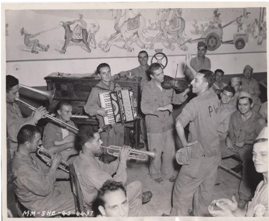
Figure 1 American-born Italian POW, band leader, Nov. 24, 1943.

as military prisoners of war. ix The confusion seems to lie in the multiple groups the United States targeted for (potential) detainment leading up to and during World War II. At one time or another, they arrested and/or restricted the activities of various groups of people associated with Germany, Italy, and Japan. These groups included: members of the military, civilians (e.g., foreigners found on U.S. soil or waters, such as cruise ship workers, as well as foreign-born legal U.S. residents), and U.S. citizens who were ethnically German, Italian, or Japanese. x Adding to the confusion is that the World War II Italian POW case is not a clear-cut case of EPWs given Italy's changing political relationship to the Allies. Indeed, the Allies did not treat all Axis POWs similarly (Krammer 1983, 1997, and 2020; Doyle 2010). In September 1943 General Pietro Badoglio of Italy signed the Cassibile Armistice with the Allied Forces, leading to, as we will see, a confusing status for Italian POWs. To muddy further, not all Italian POWs were Italian-born Italians: some were U.S.-born ethnic Italians and others were Slovenians who were conscripted into the Italian army. xi