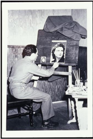
Figure 8 Italian Service Unit soldier painting, Benicia, California, artist/year un- known.

personalized, signed items were less likely to be discarded, donated, or sold? The personal, individualizing of such objects are particularly difficult to understand today without the deep knowledge of family and context. As Carr and Mytum explain: “to us as researchers, the items of creativity that have survived into the present are not easy to understand individually, even at fixed points in their lives such as at the moment of creation” (2012, 14). Too often these smaller, tangible items, are only known to us today through photographs and written descriptions of group art shows and unidentified artists. xxxviii