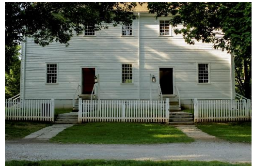
Figure 3 Mariam Ghani and Erin Ellen Kelly, Meeting House, Morning from the series When the Spirits Moved Them, They Moved , 2019. Dye transfer print on dibond. (c) Mariam Ghani & Erin Ellen Kelly; Courtesy of the artists.

along the rock wall, bodies tremble on the wood floor; the woods sway, bodies sway; shadows stretch up along the yellow paneled house, bodies stretch across the planks of the Meeting House floor. The Shakers themselves shook: their bodies trembled when the spirits moved them. Ghani and Kelly’s intervention into the space calls attention to an embodied communion that manifests through bodies situated in the world. When the Spirits Moved Them, They Moved draws upon Shaker spiritual practices and emanates from the surrounding landscape—phenomenologically connecting and situating the body within a particular community and environment.