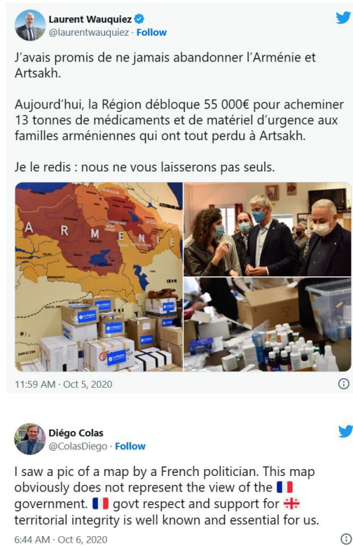
Figure 9 a & b Screenshot of a Twitter post published in an online article on Agenda.ge, an English-language news platform focusing on Georgia.

Similarly, the Greater Hayk map at one of Yerevan's metro stations is interpreted and distributed as a political argument for territorial claims on the side of the Armenian government (figure 6) when circulated in social media. Its social life in the underground of the capital city does not explicitly question the dominant narrative, that is politically recognized borders of contemporary Armenia, and therefore does not get corrected. In a recent conversation with Armenian academics about the map, I was surprised to hear that none of them supported its display at the metro station and wondered about the reasons it has not been taken down.