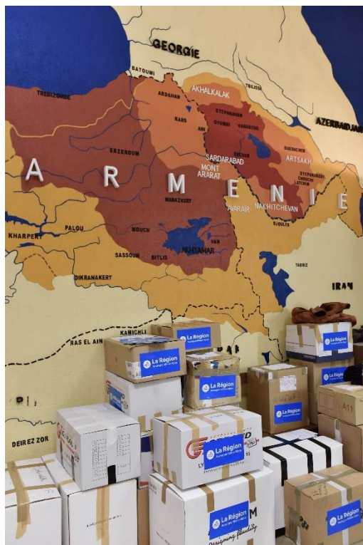
Figure 8 A map showing parts of Eastern Turkey and Artsakh as Armenian territory on a wall behind boxes of medical supplies at an event in the Auvergne-Rhône-Alpes region of France, in a photo shared Oct. 6, 2020.

Rhetorical scholar Laurie Gries observes that in the Internet age images “circulate and acquire power to co-constitute collective life as they enter into divergent associations, undergo change, and spark a wide range of consequences” (2015, 85-6). The map used for the campaign by Laurent Wauquiez acquires the power to incite collective public reproach by those nations whose territories the map claims to be Armenian. Lester Olson reminds us that even before the Internet, seemingly stable surface imagery can change its effectiveness based on the composition’s migration across place, time, and medium