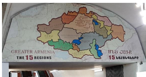
Figure 5 Map of the Kingdom of Greater Hayk (321 BC to 428 AD) at the entrance of Yerevan metro station "Republic Square" iii

Similar to Popple's public giant, the map of Greater Hayk looms large above the passerby as it is situated strategically in the high traffic area of the metro station's entrance. It performs a political spectacle as it configures the social space of "Republic Square" underground and proposes an argument that counters the officially approved territory of the Republic of Armenia. Another similarity between the two maps, even more important in relation to the potential political nature of the argument, is that both Franklin's map order and that of Greater Hayk in the subway are paid by the taxpayer and that also happens to be the common viewer.