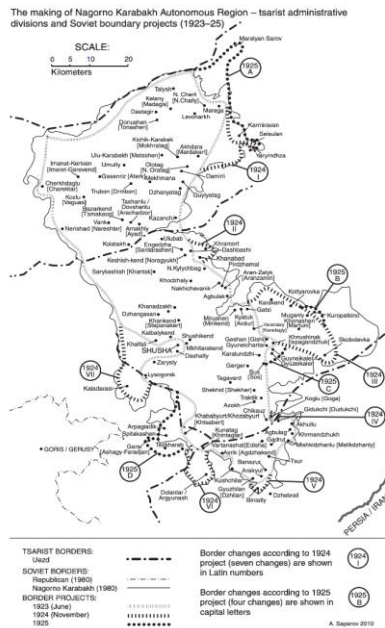
Figure 3 Map of Nagorno Karabakh presenting the tsarist administrative divisions and Soviet boundary projects. Published in From Conflict to Autonomy in the Caucasus: The Soviet Union and the Making of Abkhazia, South Ossetia and Nagorno Karabakh . (Saparov 2014, 119).

Davies and Kent, authors of The Red Atlas: How the Soviets Mapped the World (2017), explain that most of the Soviet maps present very detailed accounts of the landscape but were highly classified, and ordinary people did not have access to accurate cartographic documents. Moreover, the ones for public consumption were intentionally distorted by the government. Davies and Kent assert that Soviet maps show that the meaning of maps is never constant, and that there are always new ways that a map can change the world (2017, 29). So do the Soviet maps of Nagorno Karabakh—they change the world with every map created for the political project of the respective republic fighting over the disputed region. In 1928, in the