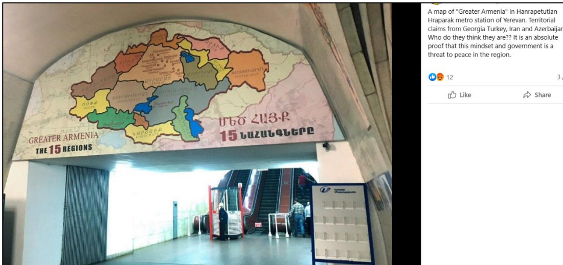
Figure 6 Social Media Reaction to the photo of Greater Hayk map during the 2020 Nagorno Karabakh War. 6b provides a close-up of the text.

Azerbaijani-born political scientist Aytan Gahramanova writes that political mythology in the South Caucasus is made up of various historical fables, which are seen not so much as the past but as a way to shape the future (2010, 137). She substantiates her argument by pointing to the USSR-born tactics of complicating the interpretation of the past whereas history becomes an instrument for advancing political claims, thus legitimizing them as “historical justice” (Gahramanova 2010, 137). Social media interpretations of the metro station map of Greater Hayk therefore fall into a category that Gahramanova calls “transformation of history into political mythology” (2010, 137).