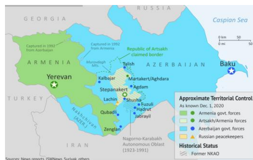
Figure 4 Map of current territorial control in Nagorno Karabakh. By Evan Centanni and Djordje Djukic. Published in Political Geography Now . December 1, 2020.

The renewed military engagements over the region in the early 2000s and the 45-day war in 2020 clearly show that the political interventions and formal delimitations of the disputed region do not suffice. Armenia lost the 2020 war, and as a result, a big portion of Nagorno Karabakh was conquered by Azerbaijan (figure 4). The question of delimitation, however, persists. There are places along the border where Azerbaijan has made military advances and annexed the sovereign Armenian territory. According to the PM of Armenia, Azerbaijan controls 41 km 2 of Armenia's territory (Pashinyan 2021). A formal delimitation and demarcation process was allegedly initiated on November 26 th , 2021, with a tripartite declaration between Armenia, Azerbaijan, and the Russian Federation, more than a year after the trilateral ceasefire agreement was signed to end the war on November 9 th , 2020.