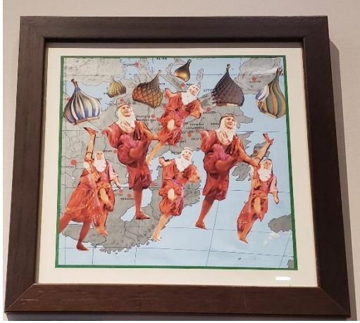
Figure 7 Sergey Parajanov's collage "Invasion" (1988).

above, from up North, organized around Moscow as its center (although the Soviet capital is technically in the middle and on the left).