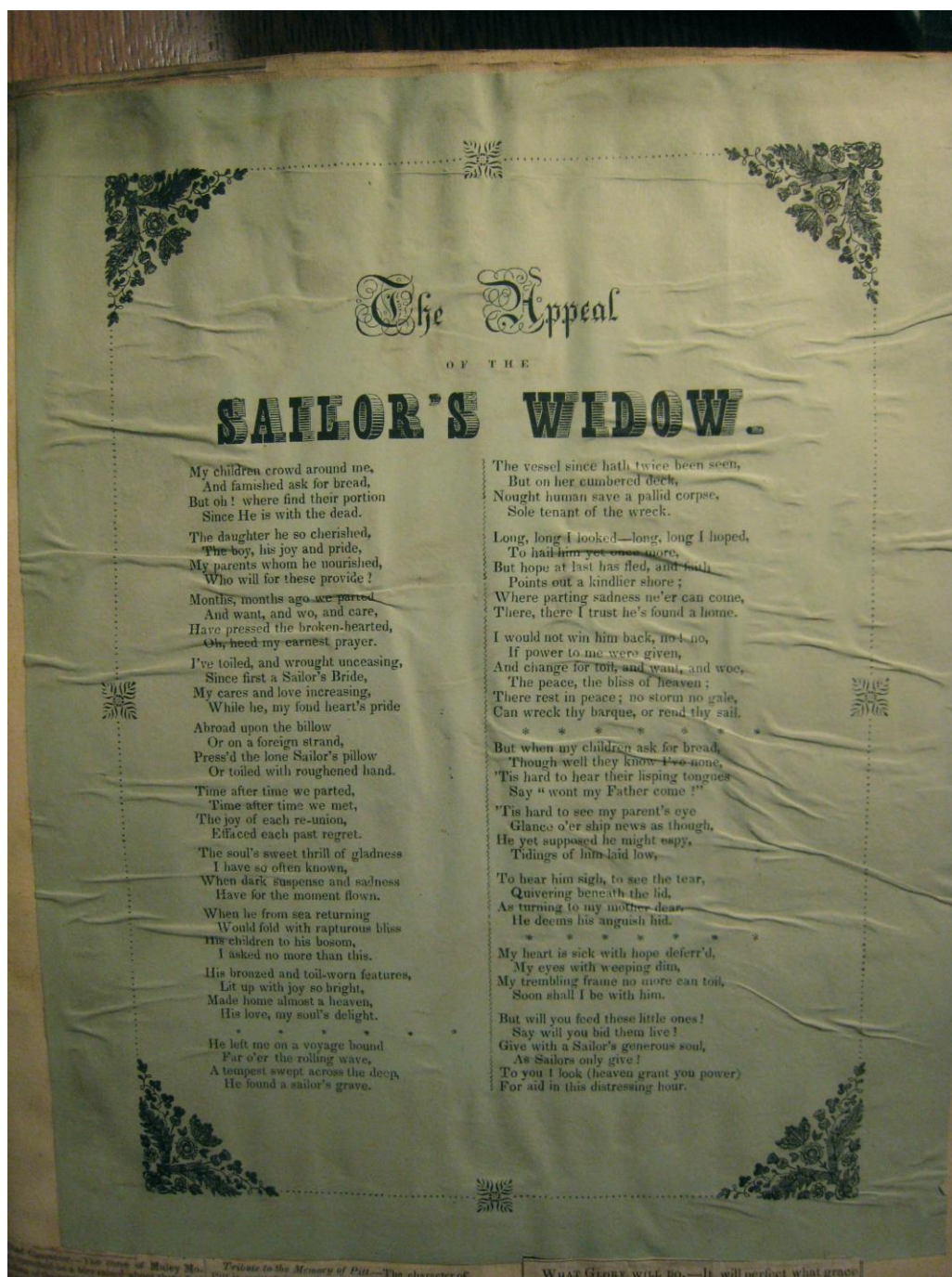
Figure 1. "The Appeal of the Sailor's Widow," Loveland Scrapbook

Periodicals present their own particular problems for the historian of reading. As we all know, only the desperately bored or compulsive reader actually reads every article and advertisement: the periodical is made for sampling, scanning, and skimming. With regard to this genre, the claim that each reader reads a different text is empirical, not metaphysical as it might