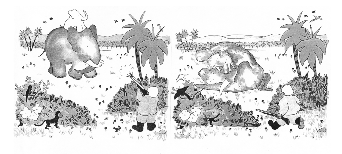
Babar se promène très heureux sur le dos de sa maman, quand un vilain chasseur, caché devière un buisson, tire sur eux.

Le charseur a tué la maman. Le singe se cache, les oiseaux s'envolent, Babar pleure. Le charseur court pour attraper le pauvre Babar.