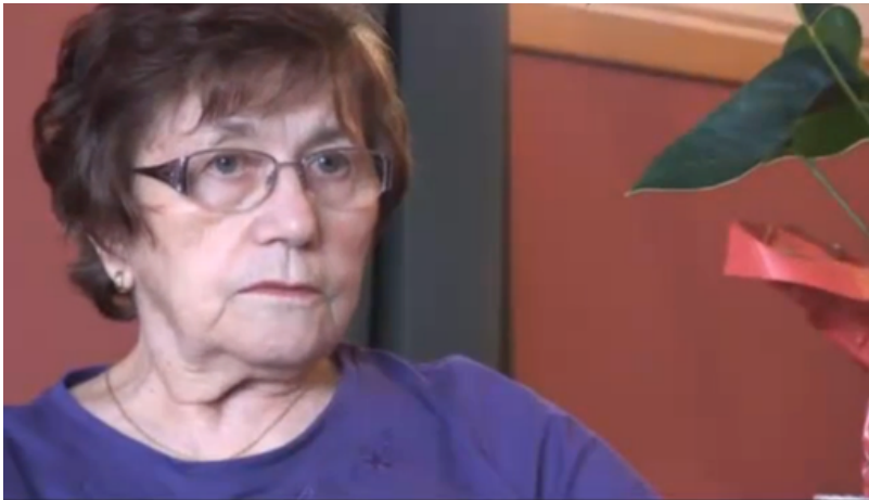
FIGURE 1. Screenshot of example of interview video clip

DIANA: Prior to this first documentary, I used video as a teaching tool to capture students' creative endeavours, to create procedural or instructional types of video, or to simply record interviews (for audio transcription purposes) to supplement quantitative data in mixed methods research. With the purchase of my new camera, I began documenting my nieces' learning-to-read experiences, the stillness of nature, and my mother's tomato sauce ritual. While I had footage of family members and events, I had yet to practice the art of video interviewing. I wanted to practice setting up and conducting on-camera interviews as learned in my documentary course, and I welcomed the opportunity to practice with my mother. I practiced setting up the camera, the background, the lighting, and asking her open-ended questions during our conversation, to which she often responded using stories. I captured those stories on video. Figure 1 demonstrates an example of an on-camera interview incorporated into the documentary.