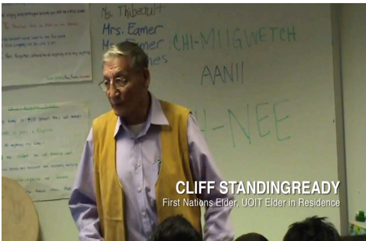
FIGURE 8. Still photo from video footage of First Nations Elder

As Diana notes, it is difficult to decide what to include and what to omit as each decision serves to tell the story in a different way. We made decisions based primarily on the quality of the photos, but also tried to ensure that we included both boys and girls, and gave voice to the teachers and guests in equal measure. Video clips of a Lakota elder (see Figure 8) and award winning aboriginal musician Tracy Bone (see Figure 9) shown engaging with the students enable the viewer to experience, in part, what the students experienced in person. Snippets of student generated digital texts offer the audience a glimpse of the learning that took place from the student's perspective. The research documentary, Exploring Social Justice Through Digital Literacies (Hughes, 2013) can be viewed on YouTube at: http://www.youtube.com/watch?v=dZOt6RDhkVY . 1