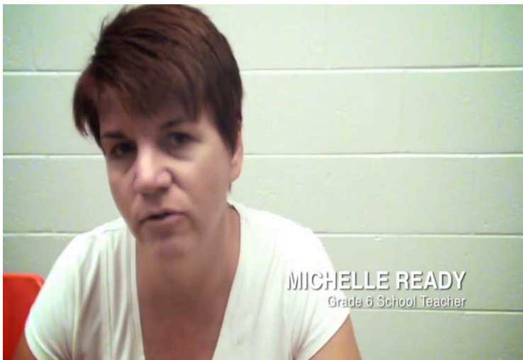
FIGURE 7. Still photo from interview clip with classroom teacher