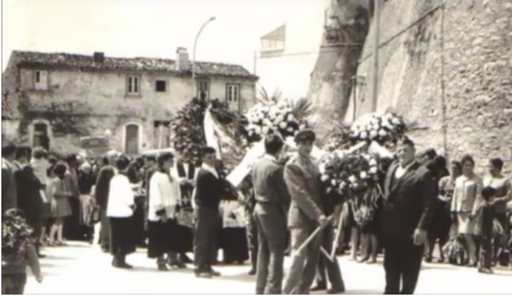
FIGURE 4. Old photo of village included in documentary