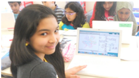
FIGURE 2. Creating a Tagxedo