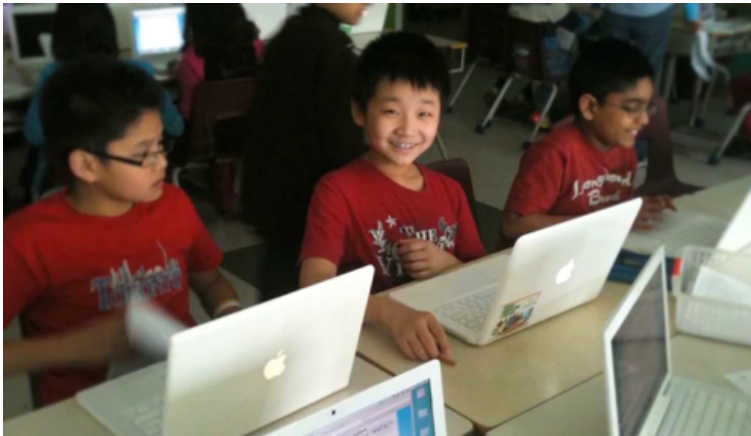
FIGURE 6. Working on MacBooks

the researcher, explaining the research and the activities the students engaged in throughout the study. This framework enabled us to better structure the documentary and kept us focused on our purpose, which was to make the research findings more accessible to the general public. The juxtaposition of the scholar speaking about the purpose of the research with various still shots and videoclips of the research project offers the audience a rich and more personal look into the research itself. Still images of the students engaged in learning activities (see Figure 6) are interwoven with the classroom teachers commenting on the project (see Figure 7).