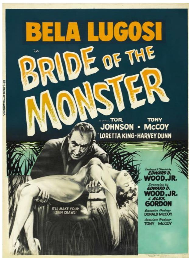
Figure 2. Artist's rendering of Lugosi with fangs in the one-sheet for Ed Wood's Bride of the Monster (1955).

Consider Count von Count, the popular Muppet that has appeared on Sesame Street since 1972. As voiced first by Jerry Nelson and then by Matt Vogel, Count von Count sounds like Lugosi, an approximation of Lugosi's accent that does not infringe on existing trademarks. 9 He also looks like Lugosi, meaning the slicked-back hair with widow's peak, pronounced eyebrows, and evening dress with cape. But he doesn't look like Lugosi, meaning he is short and purple and only has four fingers on each hand. He also wears a monocle. 10 And then there is the fact