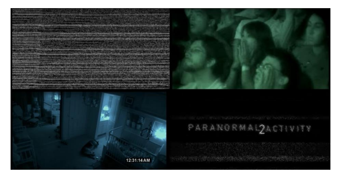
Figure 2: Haunted found footage in the Paranormal Activity 2 trailer (Assembled Screenshots)

The remainder of the trailer excels in building even more tension, flashing between more digital distortion and seemingly banal scenes from a home security camera system: a child's bedroom with a baby in a crib and a dog sleeping on the floor; a serene back patio, a sleepy kitchen. Towards the end of the trailer, the baby's room is disturbingly graced by a shadowy figure looming near the crib—the child and dog now eerily missing from the shot. The title card flashes onscreen, followed by the franchise's official web address. Just as the trailer appears to be at an end, it offers one more unsettling moment as the footage begins to slowly rewind by itself; in revisiting the previous horrors in reverse, the promo seems to playfully question: who is in control of the projection? Is the space of the diegetic movie theater similarly plagued as the one onscreen?