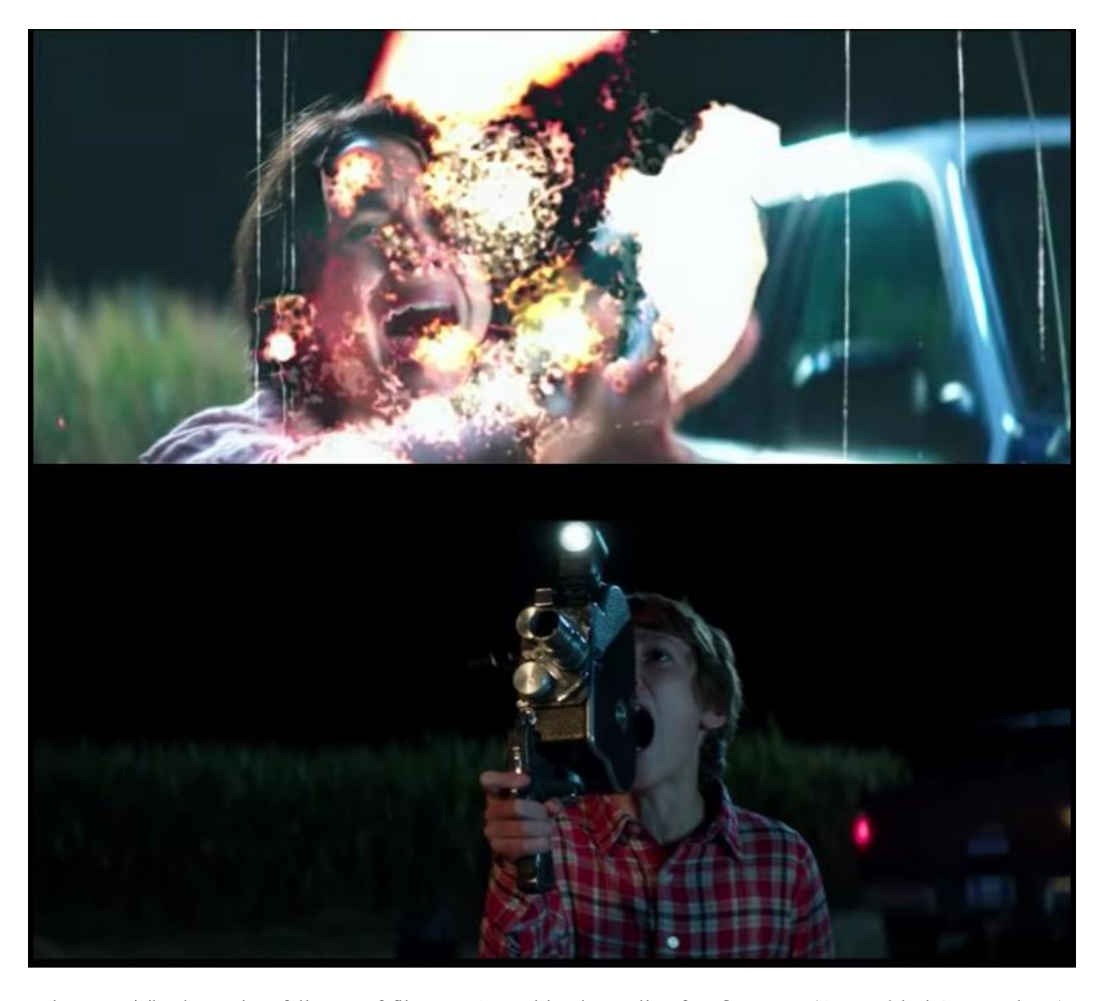
Figure 3: The haunting failures of film, projected in the trailer for Sinister 2 (Assembled Screenshots)

movies—the projection mishaps, dirty floors, rowdy patrons, and poor screen conditions that often constitute the spaces and experiences of cinemagoing. These "failures" help to explain at least in part what happened at the Danbarry Cinemas the day that Sinister 2 's Bughuul appeared onscreen to (quite literally within the diegetic world of the film) capture and terrorize children, instead of bright, sweet, and endearing CGI animated characters. [Fig 3.]