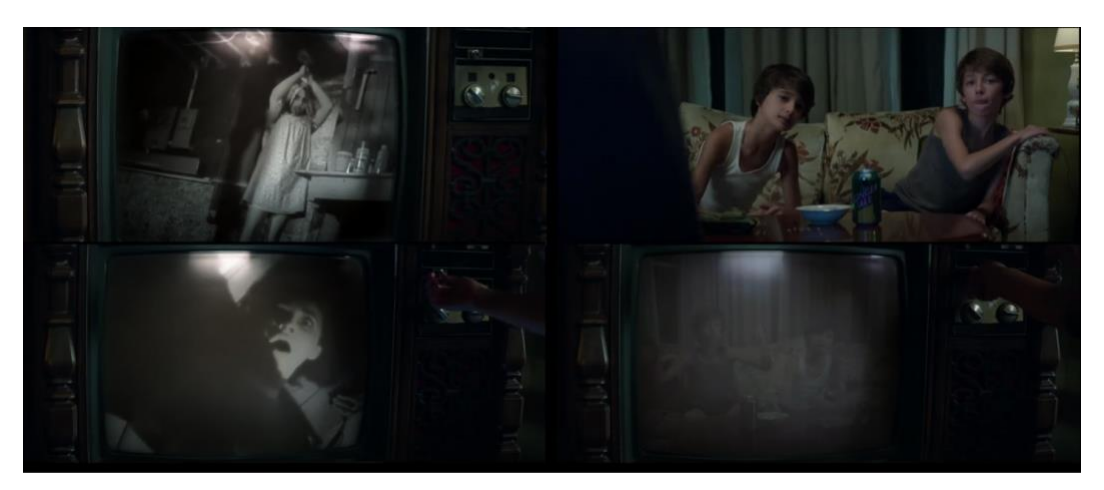
Figure 1: The children of Sinister 2 , drawn to Night of the Living Dead (1968) on TV (Assembled Screenshots)

home TV broadcast of Night of the Living Dead (1968) [Fig 1]. From there, Moore's claims about a screen filled with children and parents in peril is not incorrect, as the trailer features several such moments of horror: newspaper clippings about murdered families; homicide scenes and autopsy photos; children having nightmares; and admittedly unsettling home movie footage of families being tied up and, depending on the reel being viewed, electrocuted, drowned, or burned alive.