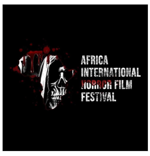
Figure 2: Africa International Horror Film Festival's Official Logo

We also aim to reawaken the consciousness among African filmmakers and industry stakeholders on the need to explore other forms of storytelling deeply rooted in African culture and tradition.