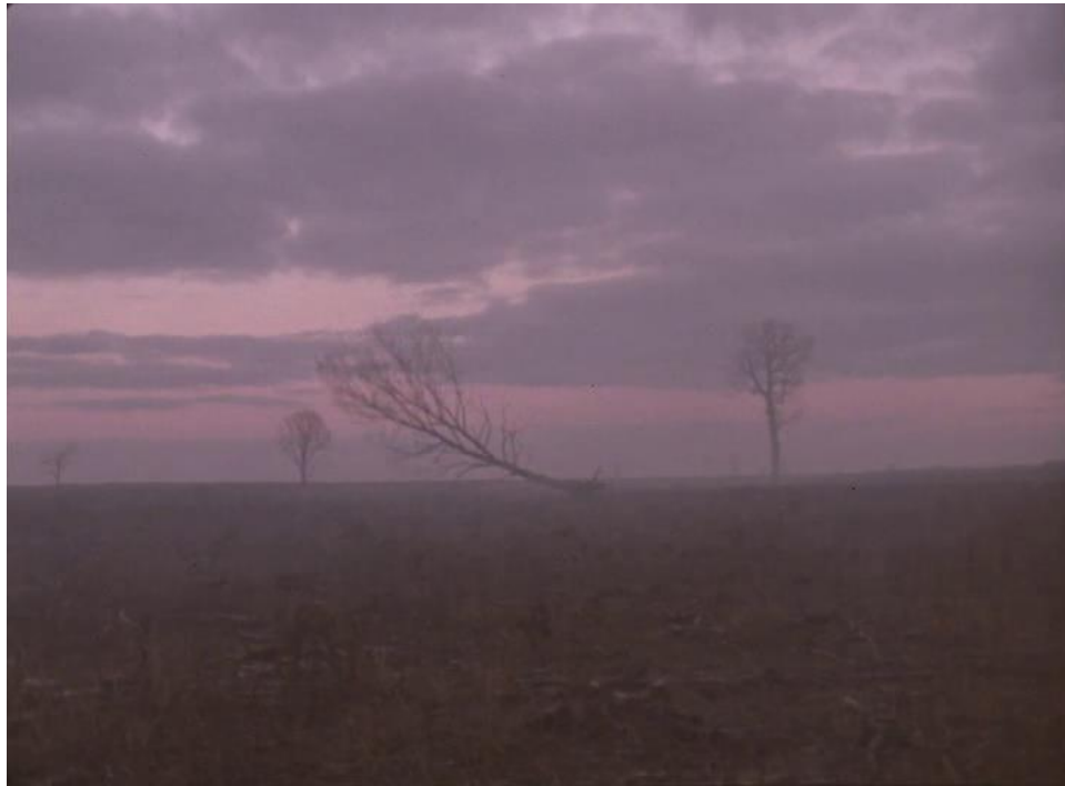
Figure 1. The Savage Hunt of King Stakh (Rubinchik, 1980)

the cursed hostile land, the vengeful ancestors, and death as deliverance from this nightmarish existence.