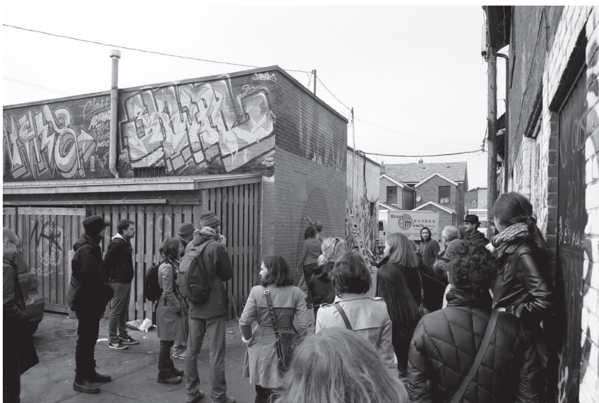
Figure 11 Tagging Along – public program, 2012. Kensington Market