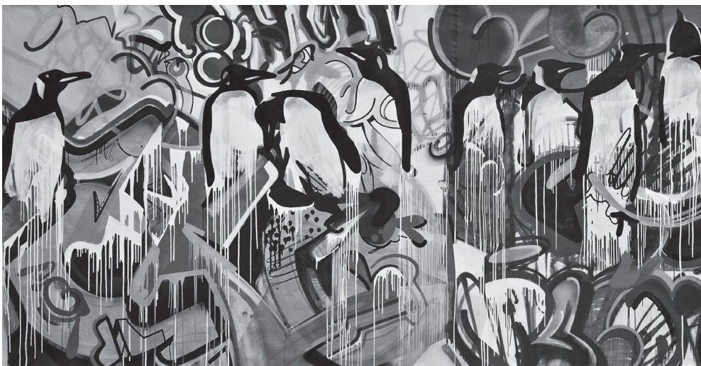
Figure 3 Pascal Paquette, What I've Learning in the Last Five Years (Empire Penguins) 2010 [© Pascal Paquette]