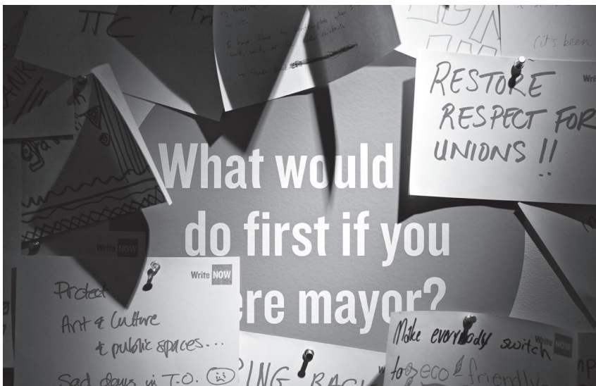
Figure 13 Post NOW comment wall – detail, 2012. Art Gallery of Ontario