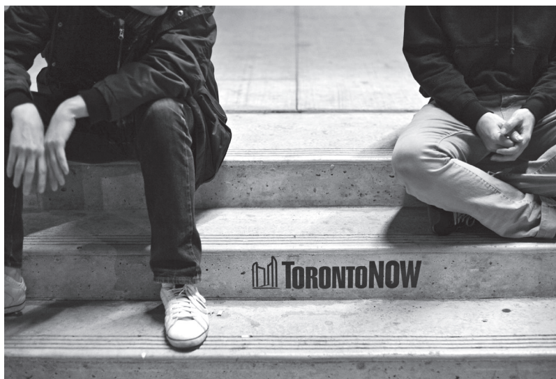
Figure 1 NOW: A Collaborative Project with Sean Martindale and Pascal Paquette, promotional image