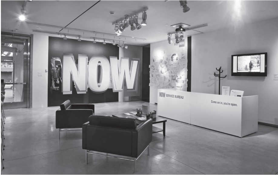
Figure 6 NOW Service Bureau – installation view, 2012. Art Gallery of Ontario