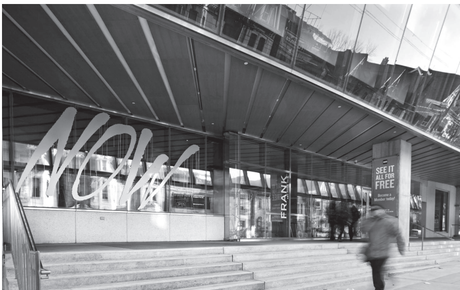
Figure 5 Young Gallery window – installation view, 2012. Art Gallery of Ontario