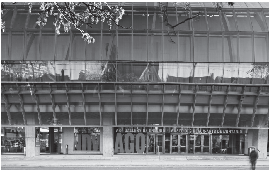
Figure 4 AGO façade, shopAGO window installation, 2012. Art Gallery of Ontario