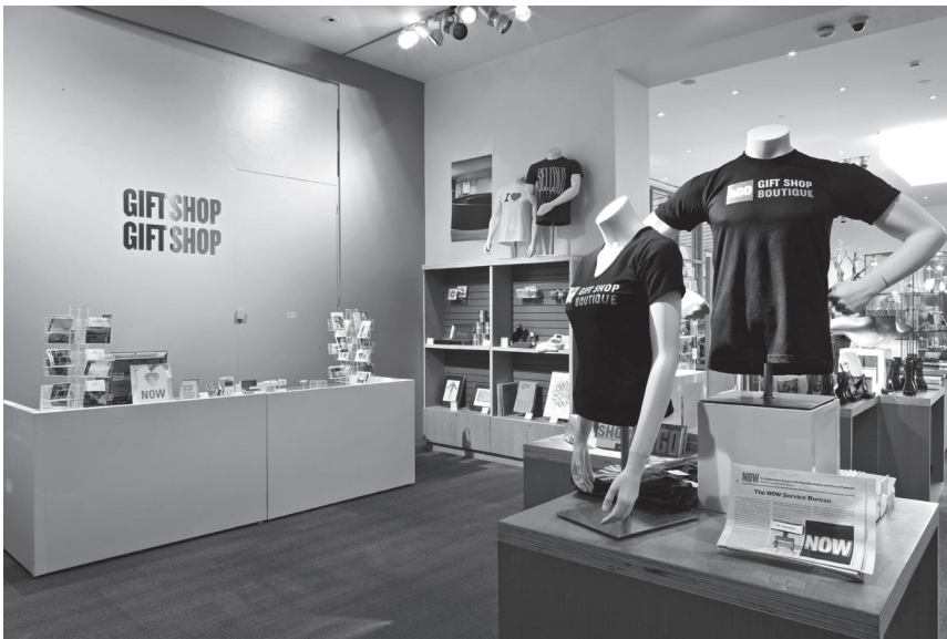
Figure 12 Gift Shop Gift Shop , installation, 2012. Art Gallery of Ontario