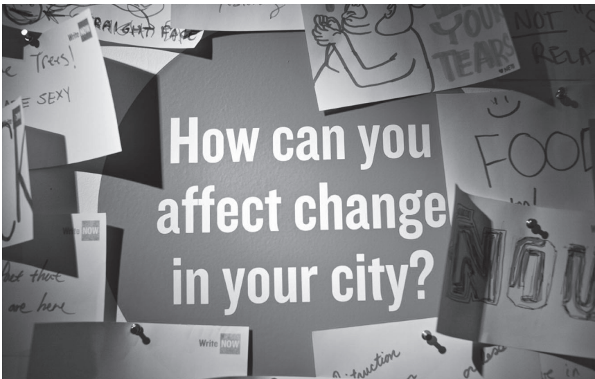
Figure 7 Post NOW comment wall – detail, 2012. Art Gallery of Ontario