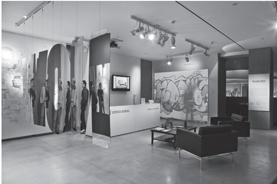
Figure 8 NOW Service Bureau – installation view, 2012. Art Gallery of Ontario