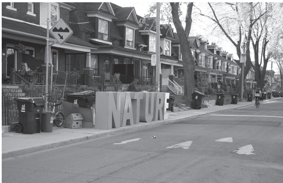
Figure 2 Sean Martindale, NATURE, Public Intervention, Toronto, Ontario 2009 [© Sean Martindale]