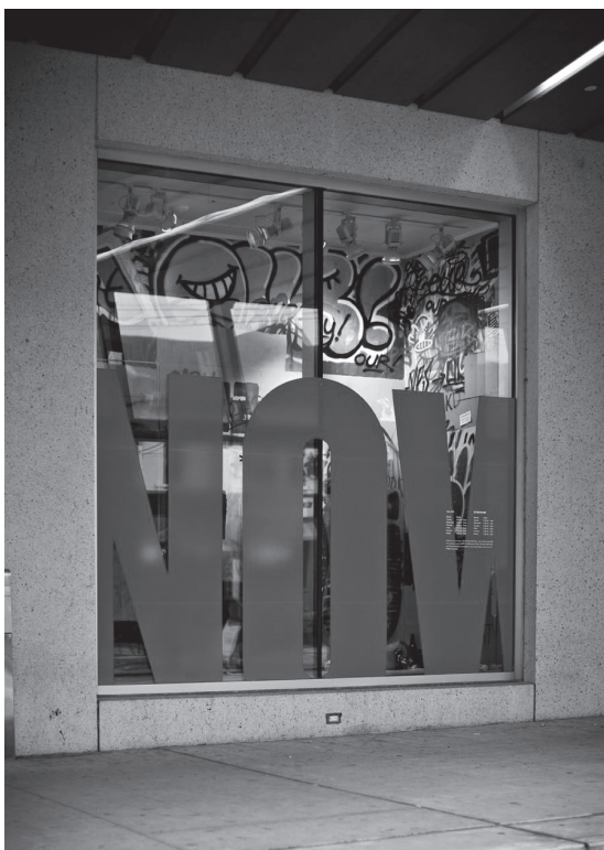
Figure 14 shopAGO window display, 2012. Art Gallery of Ontario