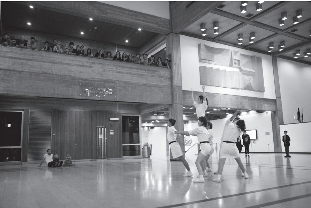
Fig.5 Performance documentation photograph of Public Movement, National Collection , 2015, Tel Aviv Museum of Art