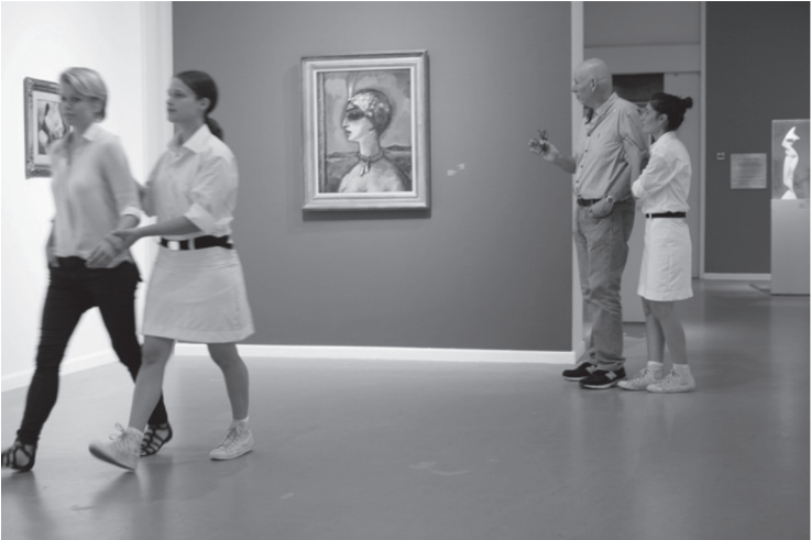
Fig.4 Performance documentation photograph of Public Movement, National Collection , 2015, Tel Aviv Museum of Art