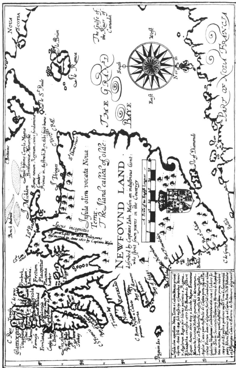
John Mason's map of Newfoundland includes a scale in English leagues.