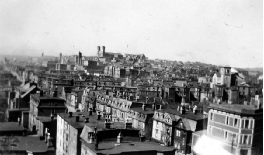
Figure 2. View taken from Mona's room in Newfoundland Hotel, St. John's.

ening clatter as they wound their way along the winding cobblestone roads. "Walking on the streets is quite a hazardous adventure," Mona observed. "The hills are terrific and both the sidewalks (such as they are) and the roads are horribly slippery. There are only a few streets in the city that are paved and so far I have only found pavement on sidewalks of two streets.... We used to worry in Charlottetown about the children sliding [sledding] on the grades, but heavens! that wasn't a patch on what they do here, simply swarms of them on almost every street slipping down the hills onto cross roads with street cars, trucks and what have you." 9 At times Mona missed the amenities of larger Canadian cities. There was no "decent place to go to revive one's drooping spirits with a spot of tea," she lamented to Jane. "Not a good restaurant in the city that is not dear or serves good food — and after 8 pm it is impossible to get a bite in the hotel. What a country! Oh for a Honey Dew or a Murray's." When Mona finally did find something she liked, the storekeepers invariably replied, "Sorry, but it is out of stock at present," meaning six months to a year." 10