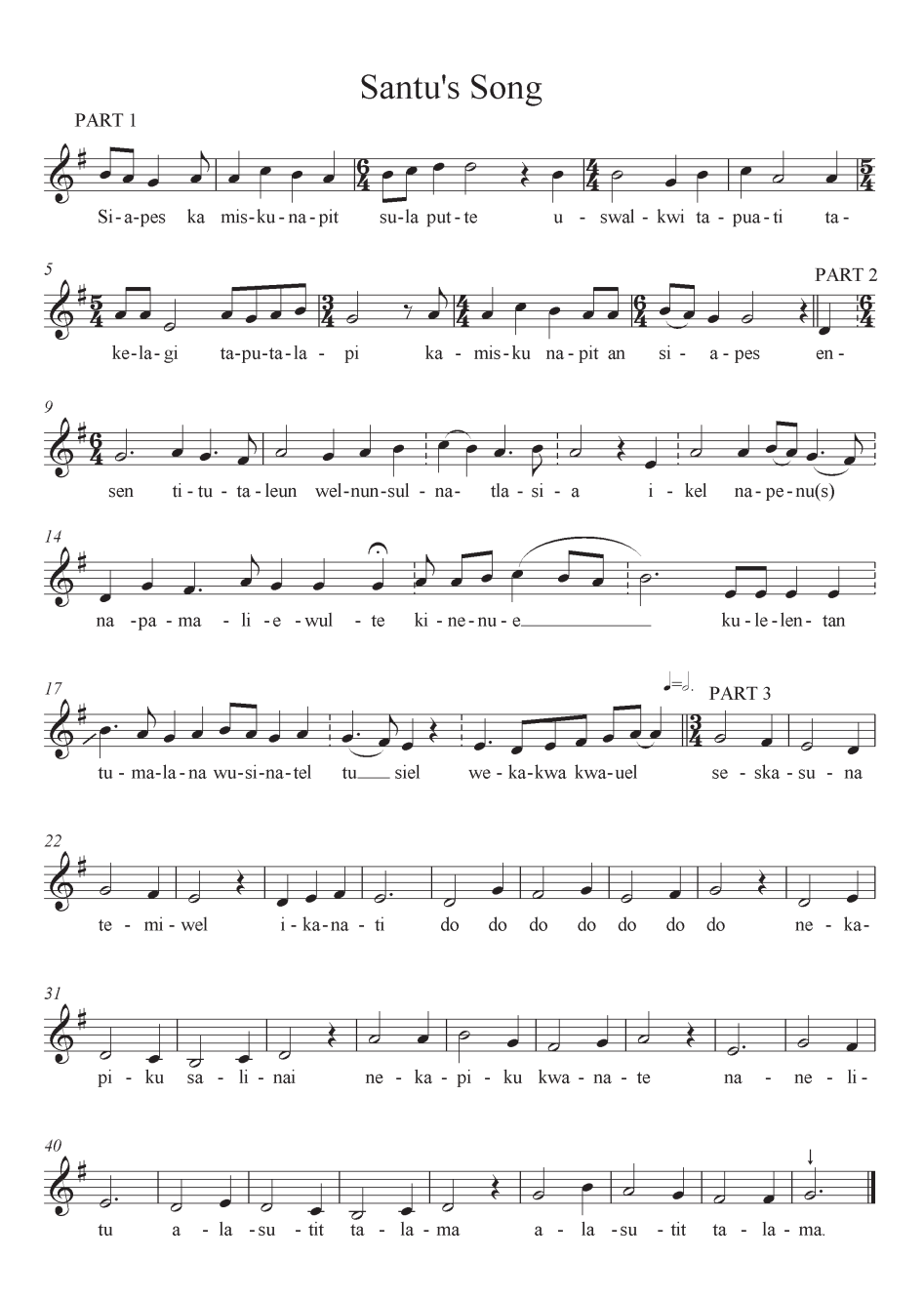
Figure 3. The Hewson/Diamond Transcription of Santu's Song.