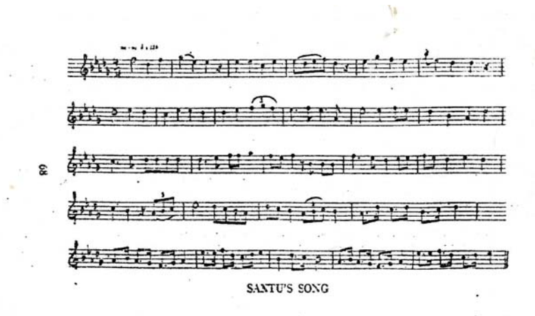
Figure 1. Facsimile of Sapir's transcription.