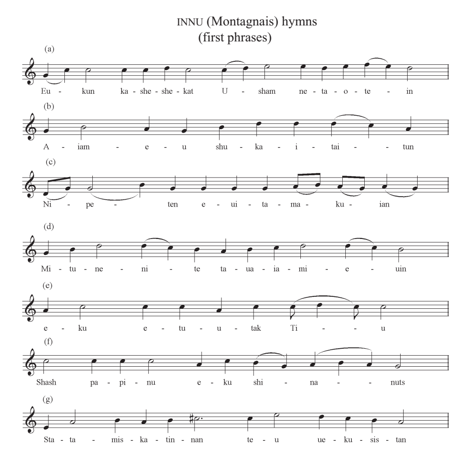
Figure 4. Innu hymns with features similar to the middle section of Santu's song. Transcribed by B. Diamond from recordings she made in Davis Inlet, Labrador, in 1981.

recorded in Labrador. Santu may have encountered such repertoire in the dealings with Labrador Indians that she described to Speck. Indeed, among recordings of Innu hymns that I made in the 1980s, there are many with similar opening formulas — an initial leap up to an elongated note (see Figure 4 below), followed by stepwise motion as the performer declaims a phrase of text, and a cadential formula. Furthermore, the cadences ending each phrase in Santu's part 2 have both rhythmic and pitch similarities vis-à-vis these Innu hymns. Some parallels are noted in Figure 4. Unlike part 1, the scale of this section, with a range of a minor seventh, is distinctly modal, becoming clearly Aeolian, especially after the first