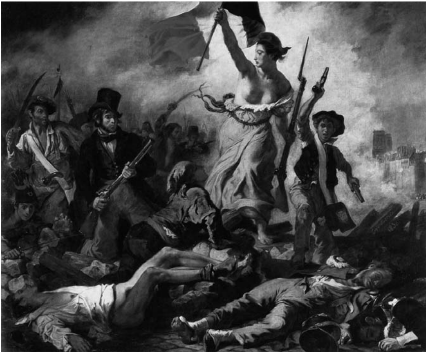
Figure 2. “Liberty Leading the People” by Eugène Delacroix. 1830. Undoubtedly one of the inspirations for the “NLA” logo. The tricolour is central, flanked by muskets, not instruments.

Liberty Leading the People (Figure 2), the leader of the pack carries the unfurled flag of the Republic — not the blue, white, and red of France, but the vertical pink, white, and green bars of the old Newfoundland flag. In Delacroix’s painting, the feminine personification of liberty carries in her other hand a rifle with bayonet — the flag bearer of the Newfoundland Liberation Army carries a guitar. In the upraised arms of the other Newfoundland insurgents are saxophones, trumpets, banjos, and fiddles — one member of this musical mob proudly brandishes a set of spoons. The design is very much in the spirit of a “people’s uprising” — a guerrilla force of singing Sandinistas bravely battling tyranny. Through this mixture of the militaristic and the musical one can sense that the arts have become the real weapon of independence on this island. Here the Newfoundland “come all ye” becomes a more forceful “Musicians of the island unite!” It is an image remarkably and no doubt purposefully similar to posters calling for violent revolution. The symbol has proven rather vogue, appearing not just on T-shirts, but on tight-fitting bellytops (for the sexy socialist), and retro-style three-quarter-length T-shirts à la the Mötley Crüe and Def Leppard shirts so popular in the 1980s. The shirt has become one of the province’s biggest exports — favoured by trend-seekers and in-