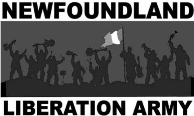
Figure 1. “Newfoundland Liberation Army” by Living Planet. Note how the instruments substitute for weapons in this “army”: fiddles, banjos, even spoons. Reproduced with permission of Living Planet.

Living Planet, a purveyor of patriotic garb in the St. John’s shopping district (also dubbed the “heritage district” by the Government of Newfoundland and Labrador) counts among its bestsellers a shirt which sports the name and logo of the “Newfoundland Liberation Army” (Figure 1). The design depicts eleven silhouetted figures cresting a horizon of blood red sky meeting rocky earth. In the spirit of Eugène Delacroix’s