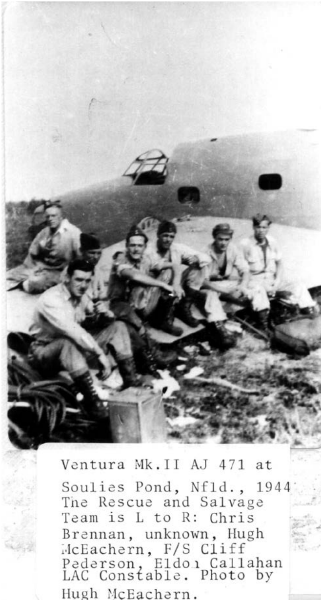
Figure 1: Recovery and Salvage team for Ventura AJ471, DfAo-01.