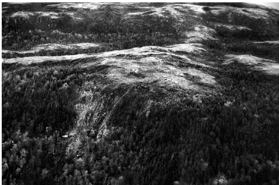
Figure 2: An image of the crash site and memorial cemetery, date unknown.

The main goal of the archaeological investigation was to locate the actual crash site. Hare Hill, renamed Crash Hill sometime after the incident, was known as the location of the crash, but not specifically where on the hill. Local outdoorspeople could not confirm the location of the crash, and most believed the area had been blasted and the site either covered or destroyed. Using a photograph from the Our Lady of Mercy