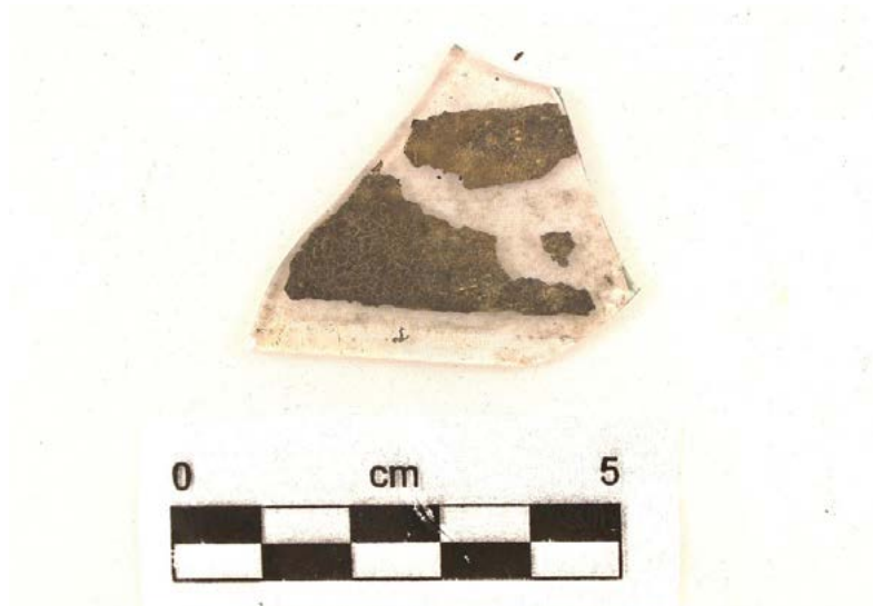
Figure 3: An example of plate glass with black paint that was found throughout the site DfAp-12.