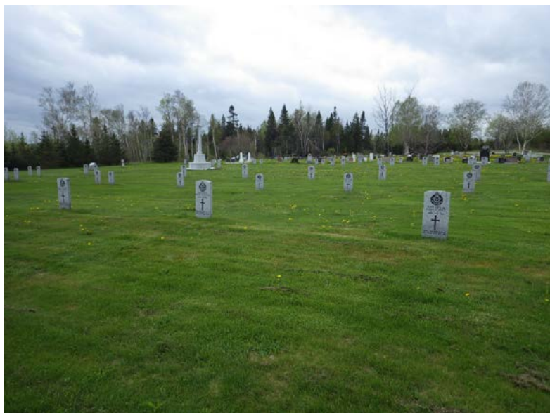
Figure 5: View of the Commonwealth War Graves in Gander taken in 2014. Note the spacing of the headstones where American servicemen were removed and repatriated.