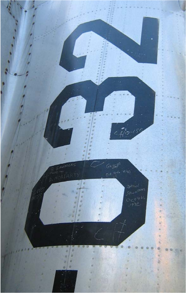
Figure 8: Graffiti at FhCd-01 taken in 2008.