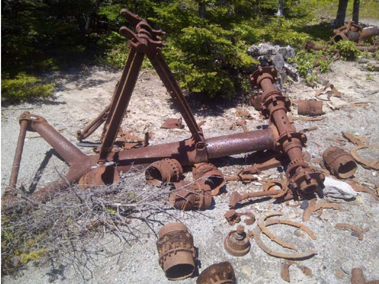
Figure 7: The highest concentration of artifacts at DcBt-01 in 2013.