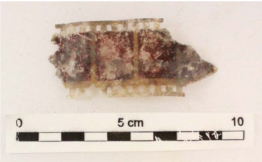
Figure 4: An example of movie reel found at The Globe, DfAp-12.