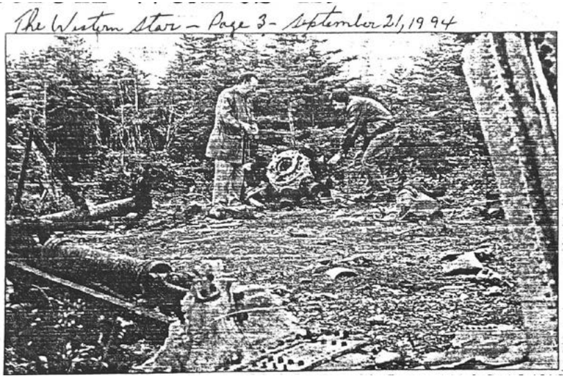
Figure 6: An image from The Western Star showing a great deal of wreckage still on site at DcBt-01 in 1994. Gale 1994.