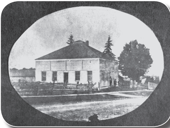
The first meeting house of the Children of Peace.