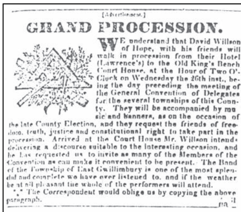
Ad for the “Grand Procession,” 1833