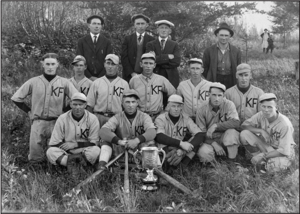
The team from Kakabeka Falls, Ontario, winners of the Rural Baseball League Championship trophy in 1913.

comradeship so yearned for by the young farmer, the absence of which often triggered a move to the city. 88